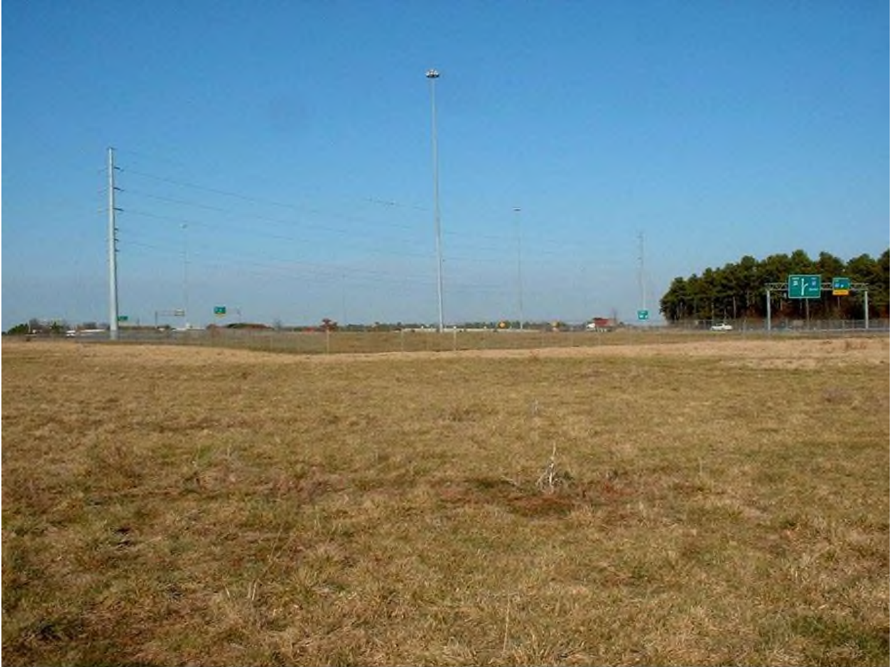
ELKO SWITCH CEMETERY, Redstone Arsenal, Madison Co. AL, January 21, 2004

View from southwest of cemetery fence toward northeast