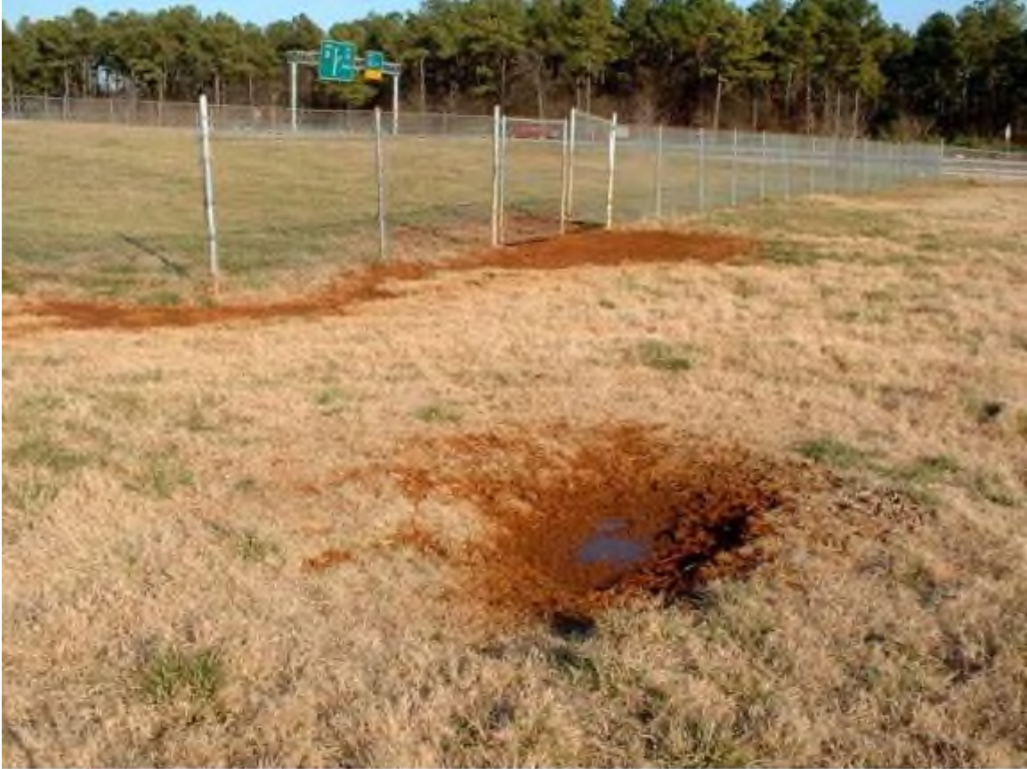
ELKO SWITCH CEMETERY, Redstone Arsenal, Madison Co. AL, January 21, 2004

This appears to be a grave depression located outside the fenced area, about 30 yards southwest of the gate into the cemetery. There appeared to be a few more slight depressions that might be indicative of graves in the area outside the cemetery fence, but it would take more than visual inspections to verify that they in fact are graves. The depression above was the most pronounced found in the area.