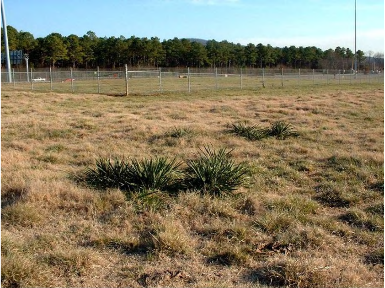
ELKO SWITCH CEMETERY, Redstone Arsenal, Madison Co. AL, January 21, 2004

The green vegetation above is part of several clusters of Yucca plants that typically indicate grave sites, as they are not indigenous to the area. These plants are located about 25 to 30 yards northwest of the cemetery fence.