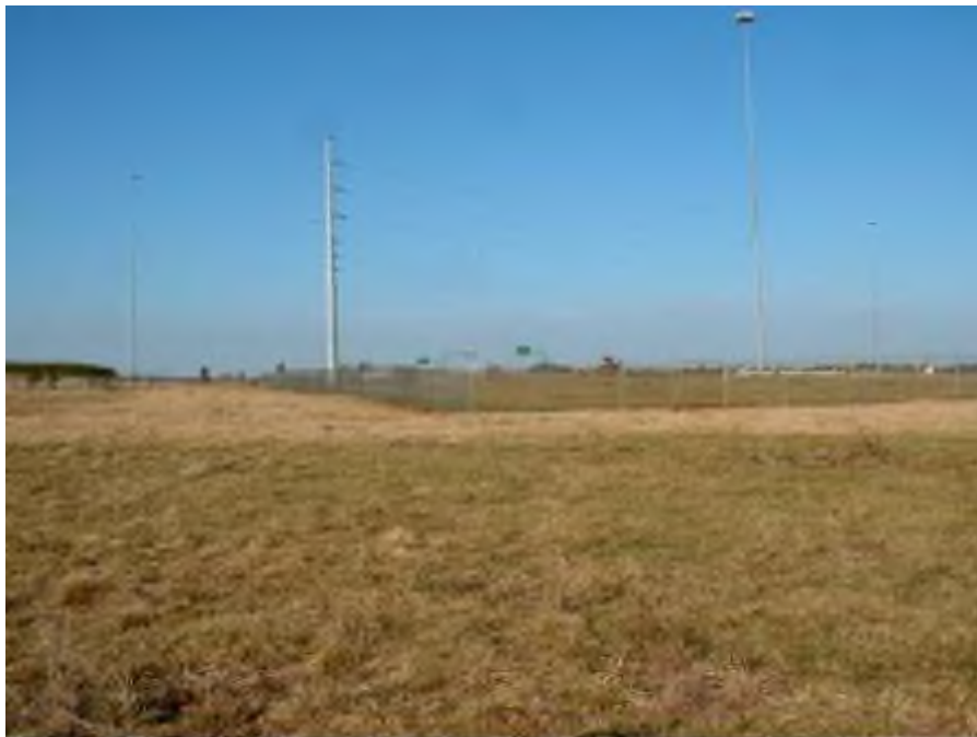
ELKO SWITCH CEMETERY, Redstone Arsenal, Madison Co. AL., January 21, 2004

Some of the photos made of the cemetery in January of 2004 are shown below: