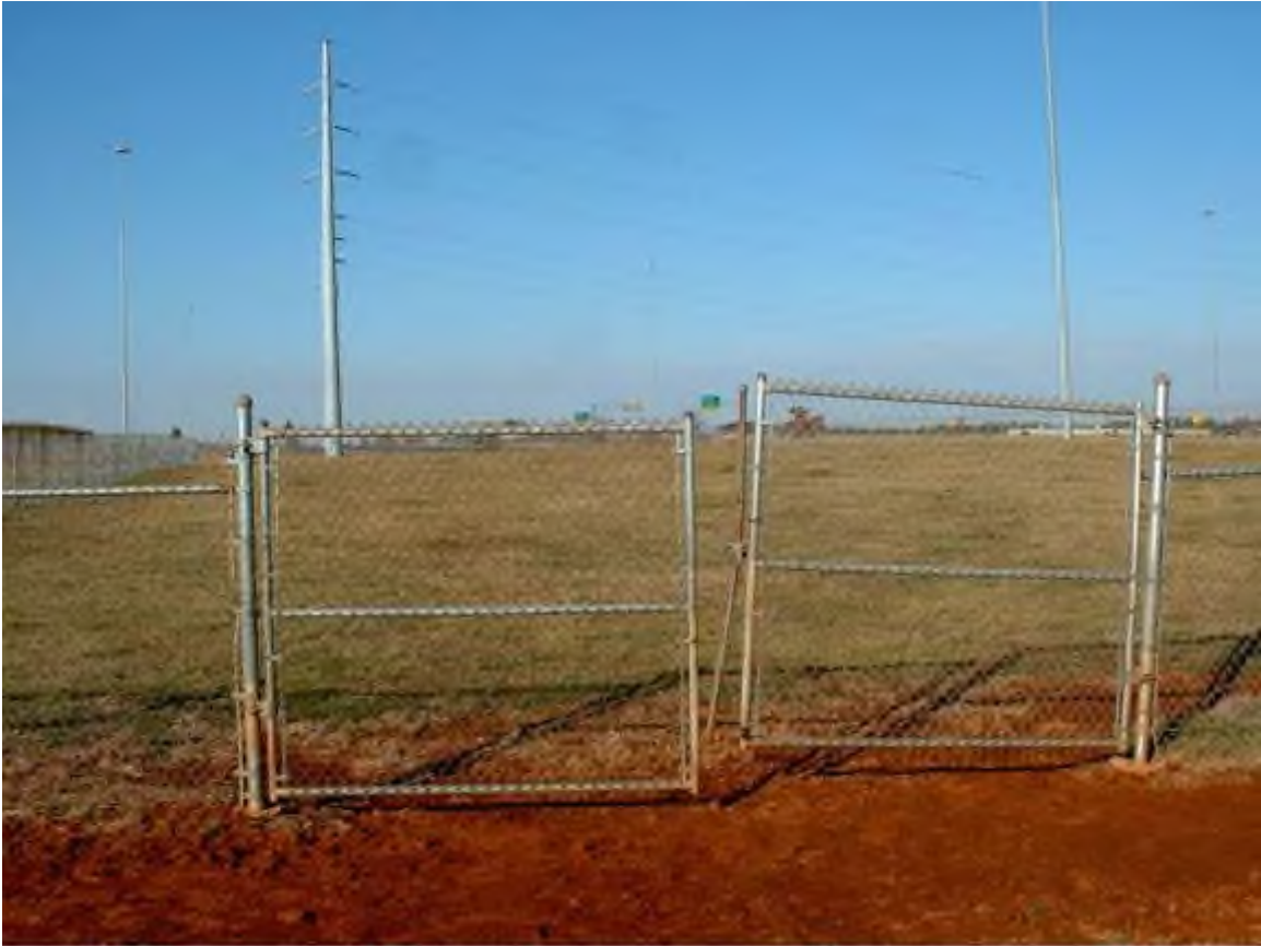
ELKO SWITCH CEMETERY, Redstone Arsenal, Madison Co. AL, January 21, 2004

This gate in the cemetery fence is located near the southwest corner; view is to the north, into the cemetery grounds.