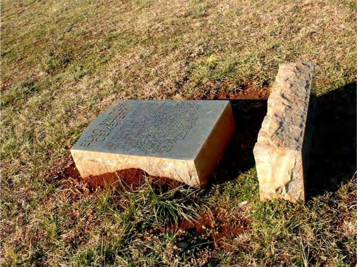
ELKO SWITCH CEMETERY, Redstone Arsenal, Madison Co. AL, January 21, 2004

The new cemetery monument is separated from its base, but lying face up.