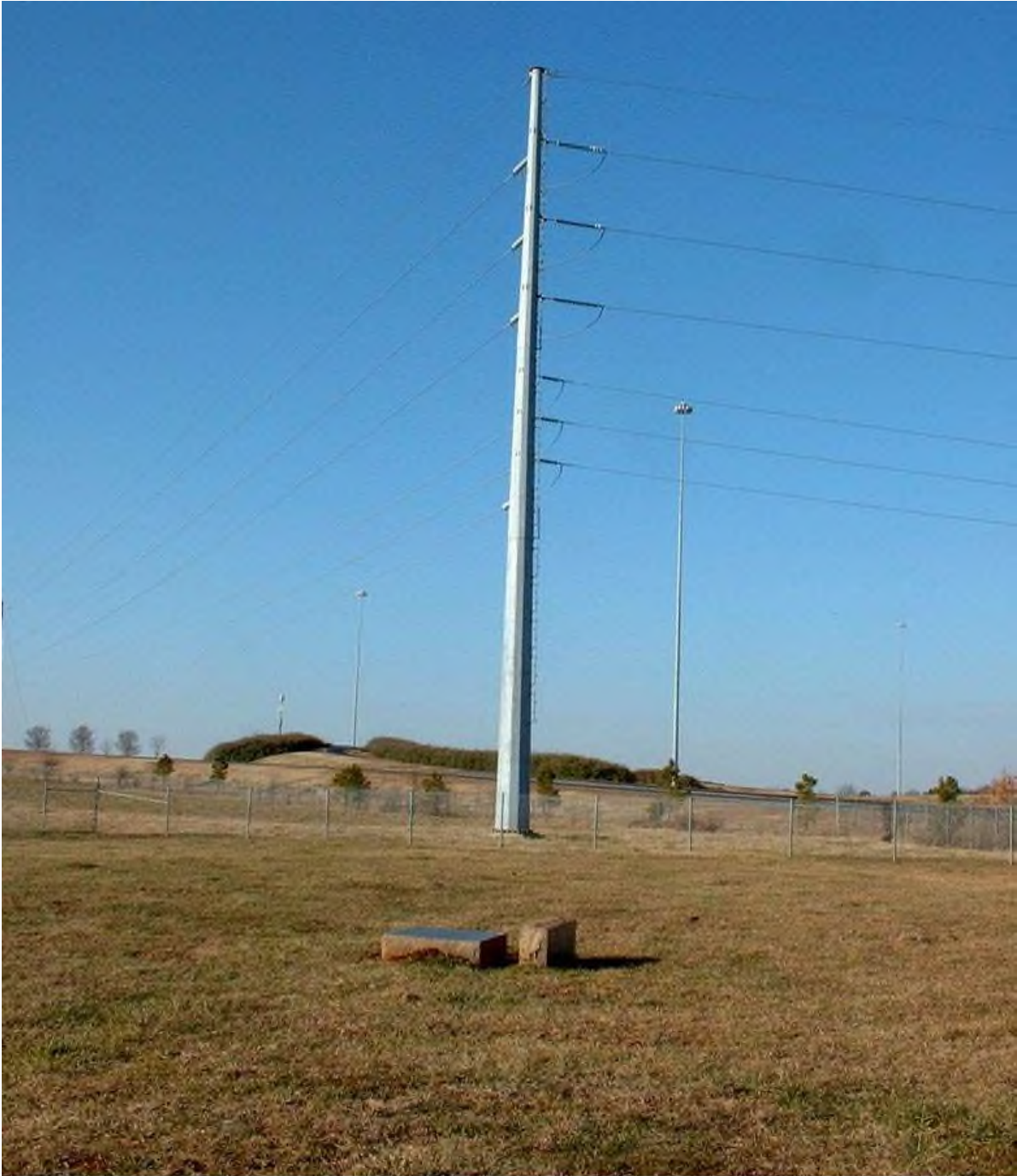
ELKO SWITCH CEMETERY, Redstone Arsenal, Madison Co. AL, January 21, 2004

New "Cemetery Monument" in center of fenced area; view to north, with exit ramp from I565 in background.