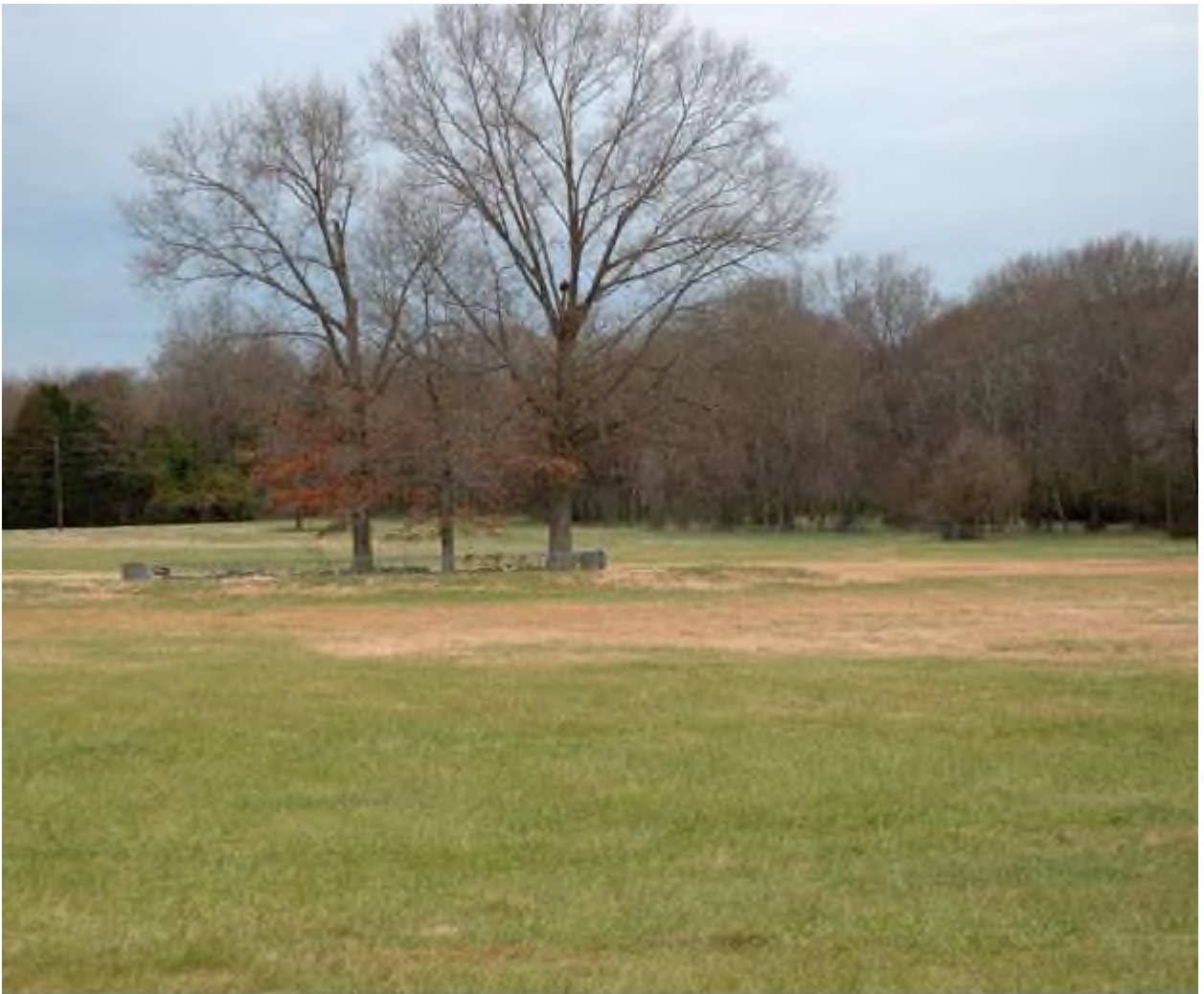
JONES CEMETERY, 37-5, Redstone Arsenal, Madison County, Alabama: E/2, S22-T4-R1W.