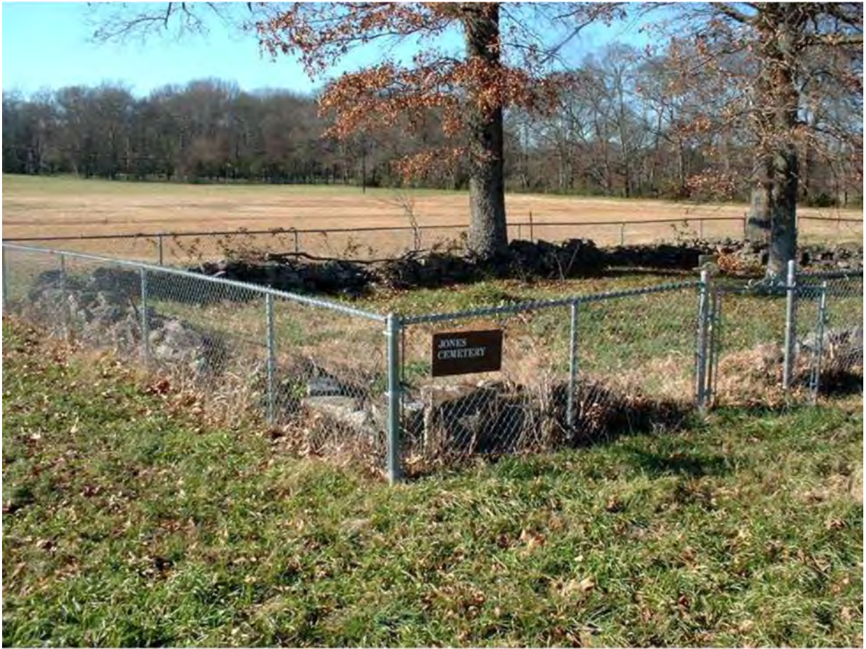
JONES CEMETERY, 37-5, Redstone Arsenal, Madison Co. AL Located west of Hipar Road in the National Guard area, E/2 of S22-T4-R1W. Access via south end of Triana Blvd., vehicle gate at Buildings 3795 & 3797. Pedestrian gates near Building 3793. Cemetery about 150 yards west of fence.