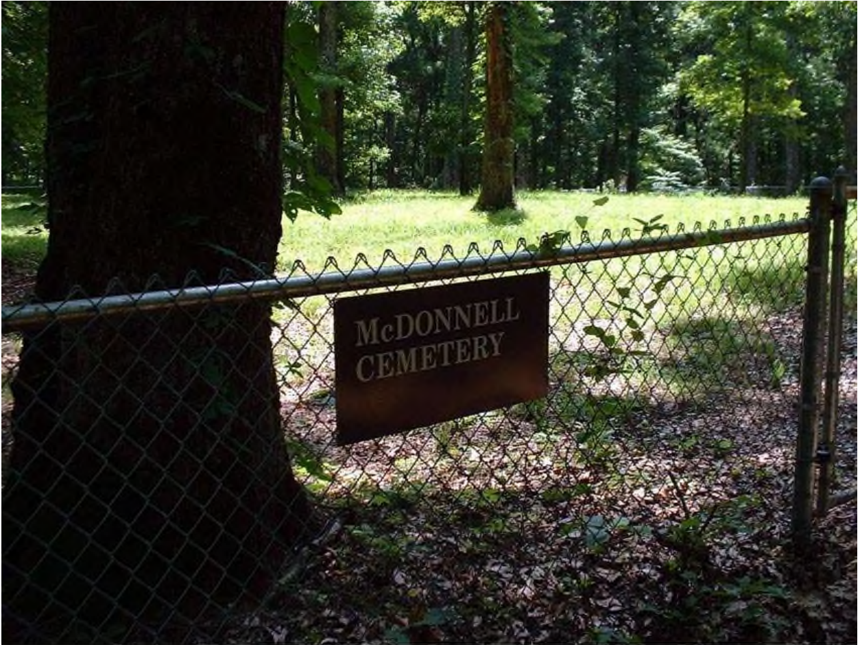
McDonnell Cemetery, Redstone Arsenal, Madison Co., AL, June, 2002.

The depth of the grave depressions is illustrated in the view along the northern edge of the fence, as shown below: