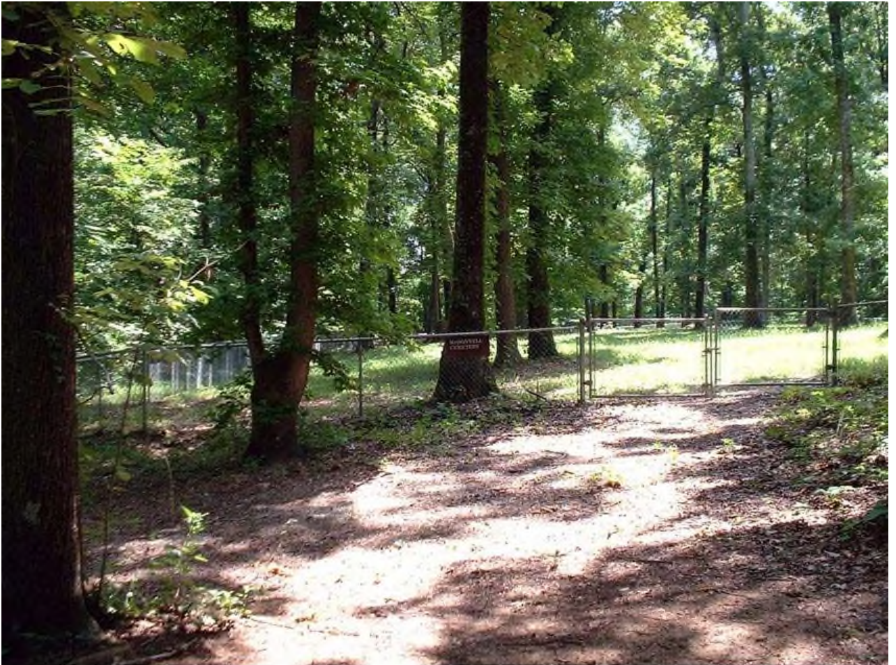
McDonnell Cemetery, Redstone Arsenal, Madison Co., AL, June, 2002.

This quiet cemetery is set back in the woods on the northeastern portion of the arsenal, at the end of a dirt and gravel road off HiPar Road.