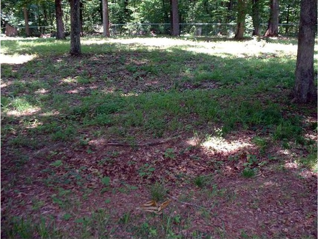
McDonnell Cemetery, Redstone Arsenal, Madison Co., AL, June, 2002. There are many sunken graves evident within this cemetery. It lies on a small knoll in the woods, and hundreds of rectangular sinks are apparent. A few are child-sized, but most are adult-sized.

With no tombstones, old land records can lead to support for the namesake of the cemetery: