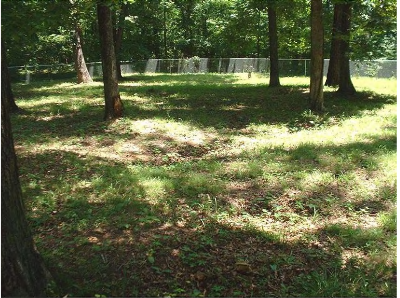
McDonnell Cemetery, Redstone Arsenal, Madison Co., AL, June, 2002.

Some of the grave depressions are so deep that they have become filled with leaves, as seen below: