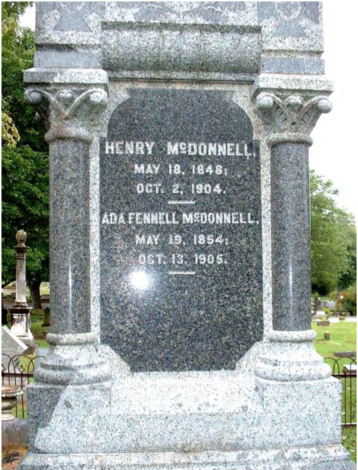
Maple Hill Cemetery (Huntsville, AL), September 7, 2004