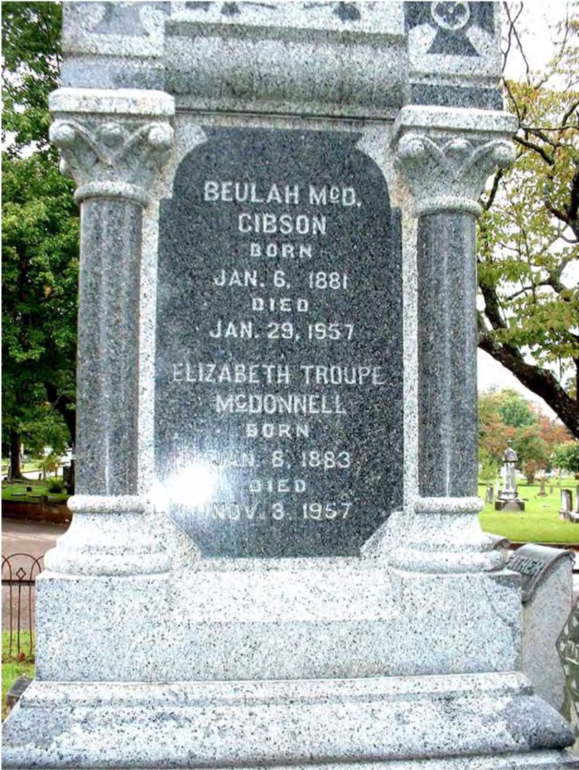
Maple Hill Cemetery (Huntsville, AL), September 7, 2004