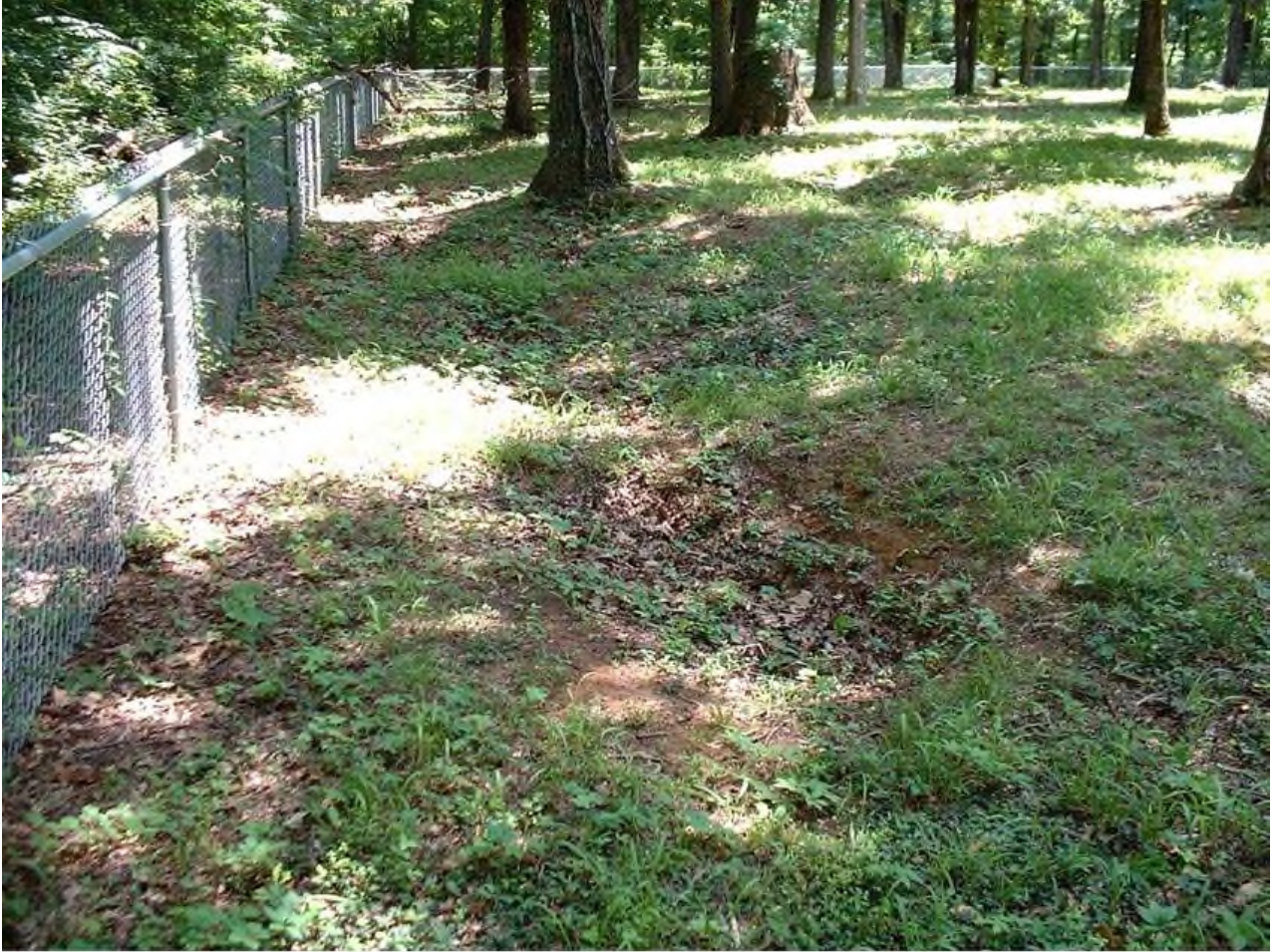
McDonnell Cemetery, Redstone Arsenal, Madison Co., AL, June, 2002.

The view below is along the eastern edge of the cemetery, which is very near the southern end of Triana Boulevard in Huntsville. There are numerous grave depressions beneath the trees and leaves.