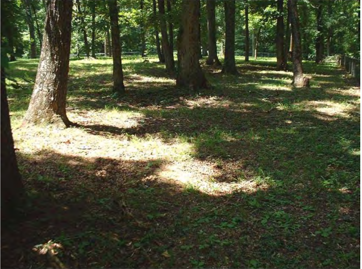
McDonnell Cemetery, Redstone Arsenal, Madison Co., AL, June, 2002.

More deep grave depressions are seen in the foreground of the photo below: