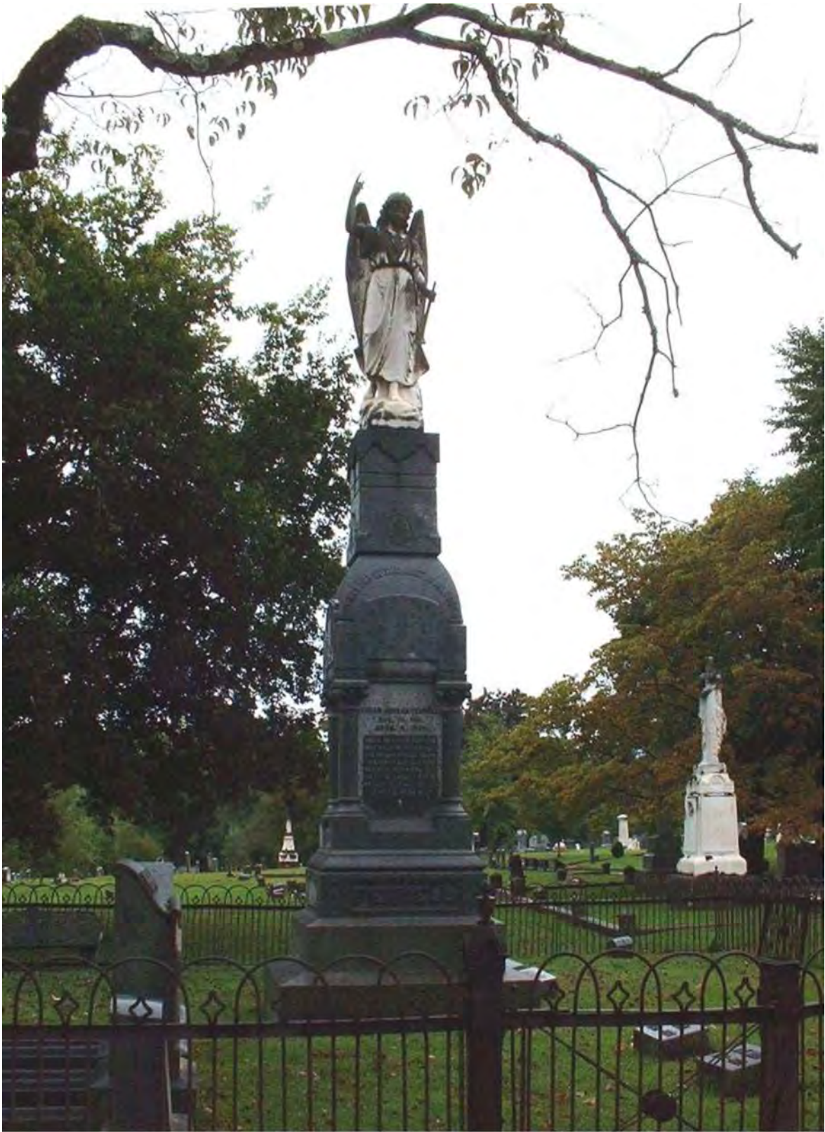
Maple Hill Cemetery (Huntsville, AL), September 7, 2004