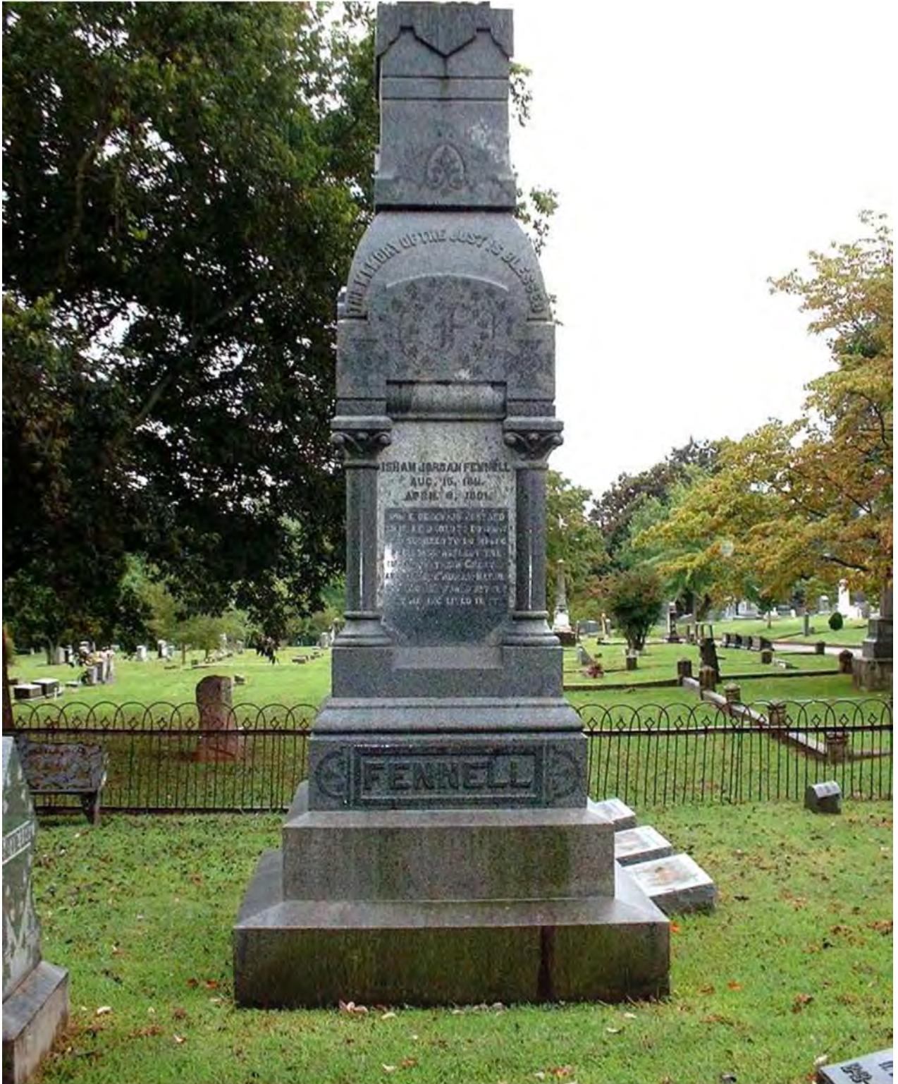
Maple Hill Cemetery (Huntsville, AL), September 7, 2004