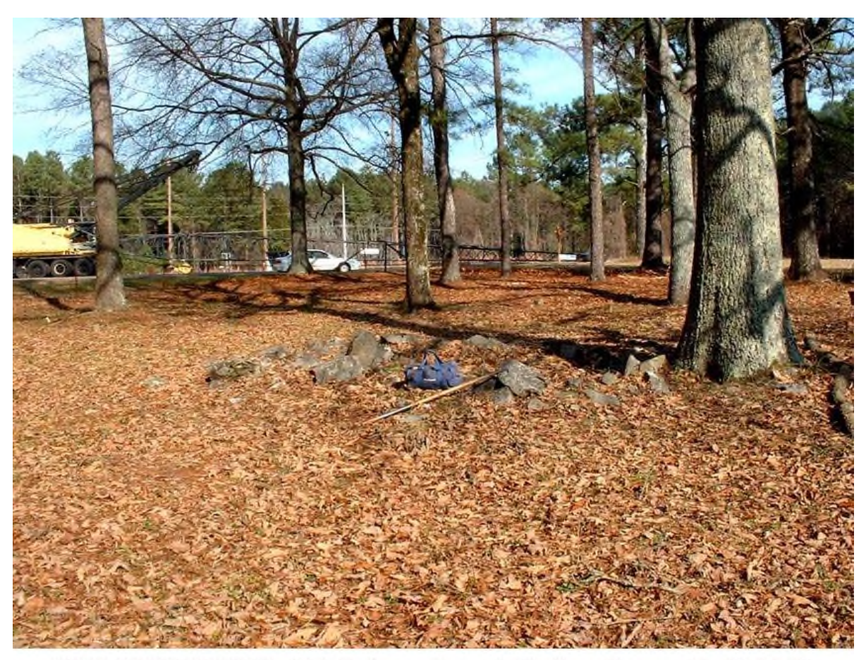
JORDAN CEMETERY, 45-1, Redstone Arsenal, Madison County, AL 12-16-02. View from SW corner toward Mariner Road; double rock-covered grave in foreground.

There are several other obvious graves, and some fieldstones and rock borders to mark the burial plots. However, there were no other inscribed tombstones found in the cemetery. The overviews of the features of the cemetery are provided below: