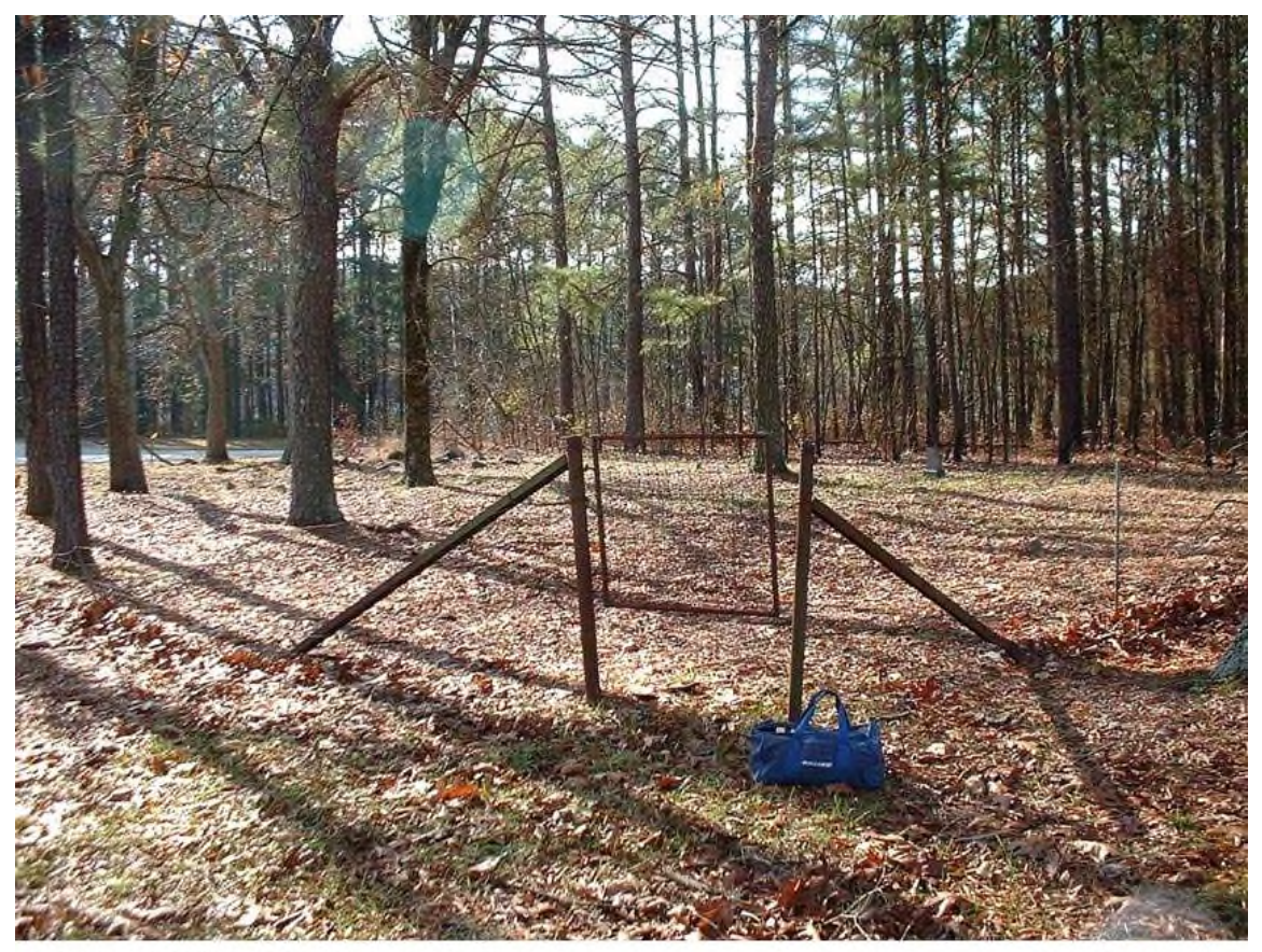
JORDAN CEMETERY, 45-1, Redstone Arsenal, Madison County, AL 12-16-02.

This cemetery is located on the southwest side of Mariner Road, just east of Dodd Road. In fact, it is near the northern end of Mariner Road, less than a quarter mile from Mariner's junction with Dodd. There is a gate at that junction, Gate C-14. However, the gate is kept locked to control access to this hazardous test area operated by Marshall Space Flight Center. Access can be gained via the control point at the guardhouse a mile south of C-14 on