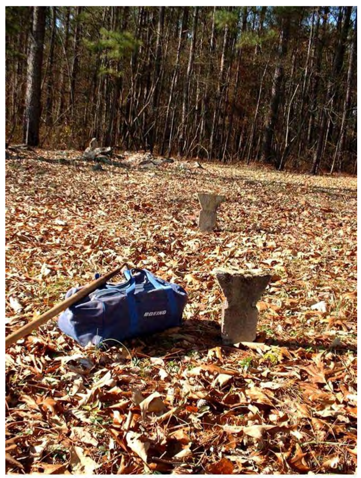
JORDAN CEMETERY, 45-1, Redstone Arsenal, Madison County, AL 12-16-02.