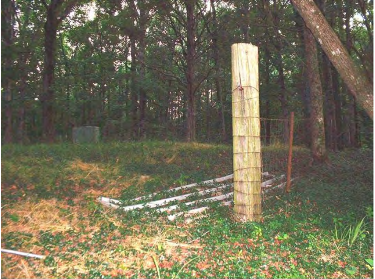
Moore - Landman Cemetery, Redstone Arsenal, Madison Co., AL, June, 2002.

View to the southwest from the entrance at the northeastern corner.