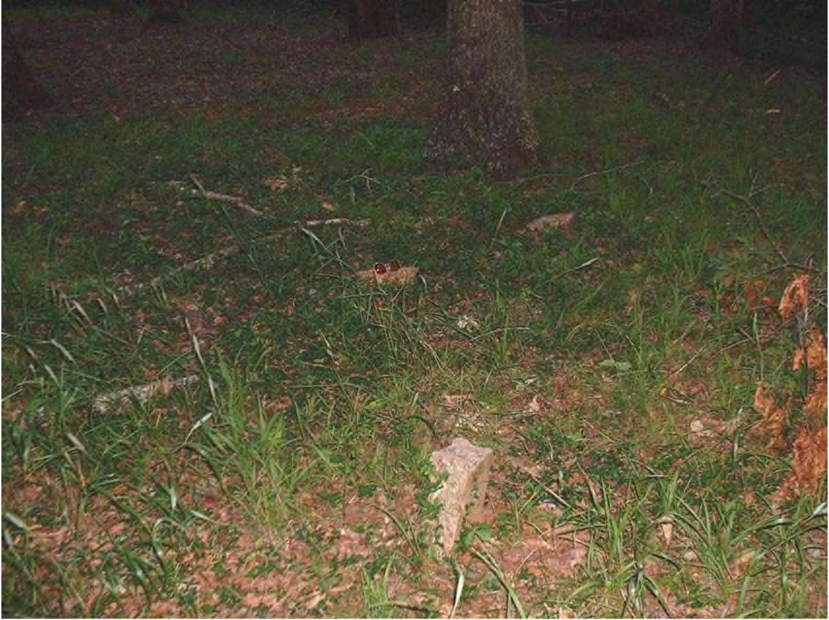
Moore - Landman Cemetery, Redstone Arsenal, Madison Co., AL, June, 2002.

More fieldstones, in foreground. Fieldstones in background (with sunglasses) appeared in previous photo.