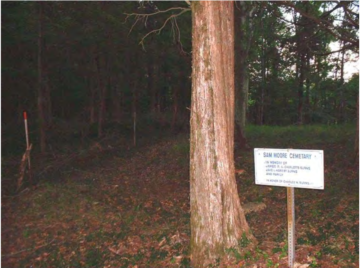
Moore - Landman Cemetery, Redstone Arsenal, Madison Co., AL, June, 2002.

View along the eastern edge of the cemetery, looking from the north.