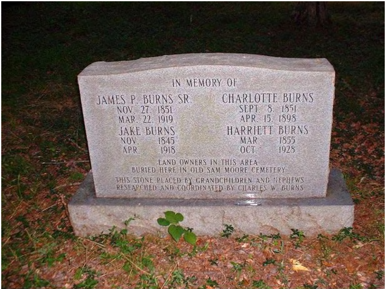
Moore - Landman Cemetery, Redstone Arsenal, Madison Co., AL, June, 2002.

Monument in the center of the cemetery. This is the only marker with inscriptions in the cemetery.