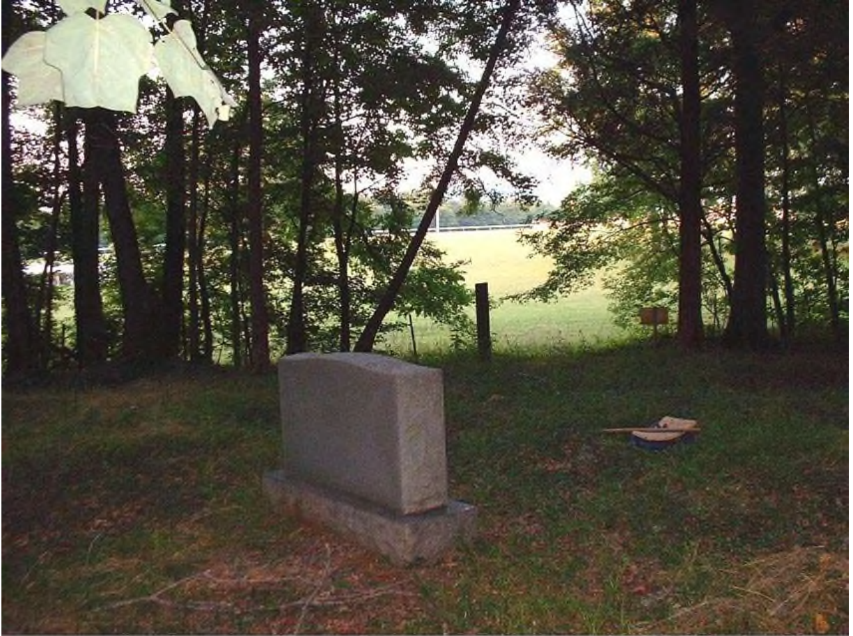
Moore - Landman Cemetery, Redstone Arsenal, Madison Co., AL, June, 2002.

Backside of the memorial to the Burns families, looking from center of the cemetery toward the north.