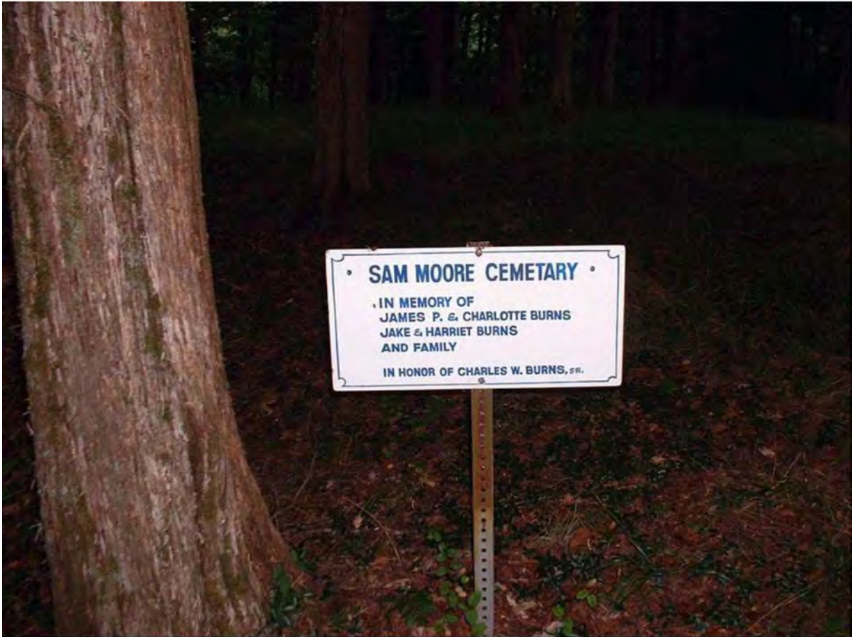
Moore - Landman Cemetery, Redstone Arsenal, Madison Co., AL, June, 2002.

Sign at entrance of cemetery, on left side.