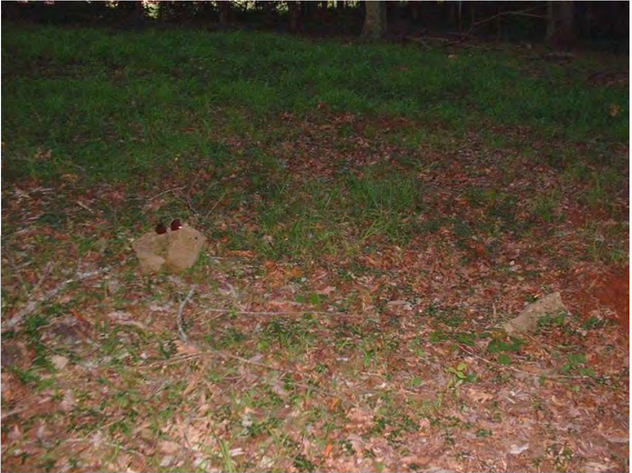
Moore - Landman Cemetery, Redstone Arsenal, Madison Co., AL, June, 2002.