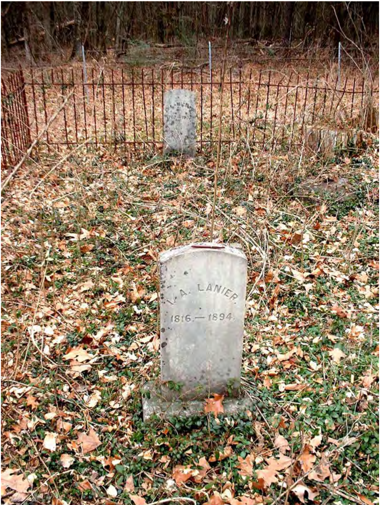
Lanier Cemetery 46-3, Redstone Arsenal, Madison Co. AL, Jan. 28, 2003