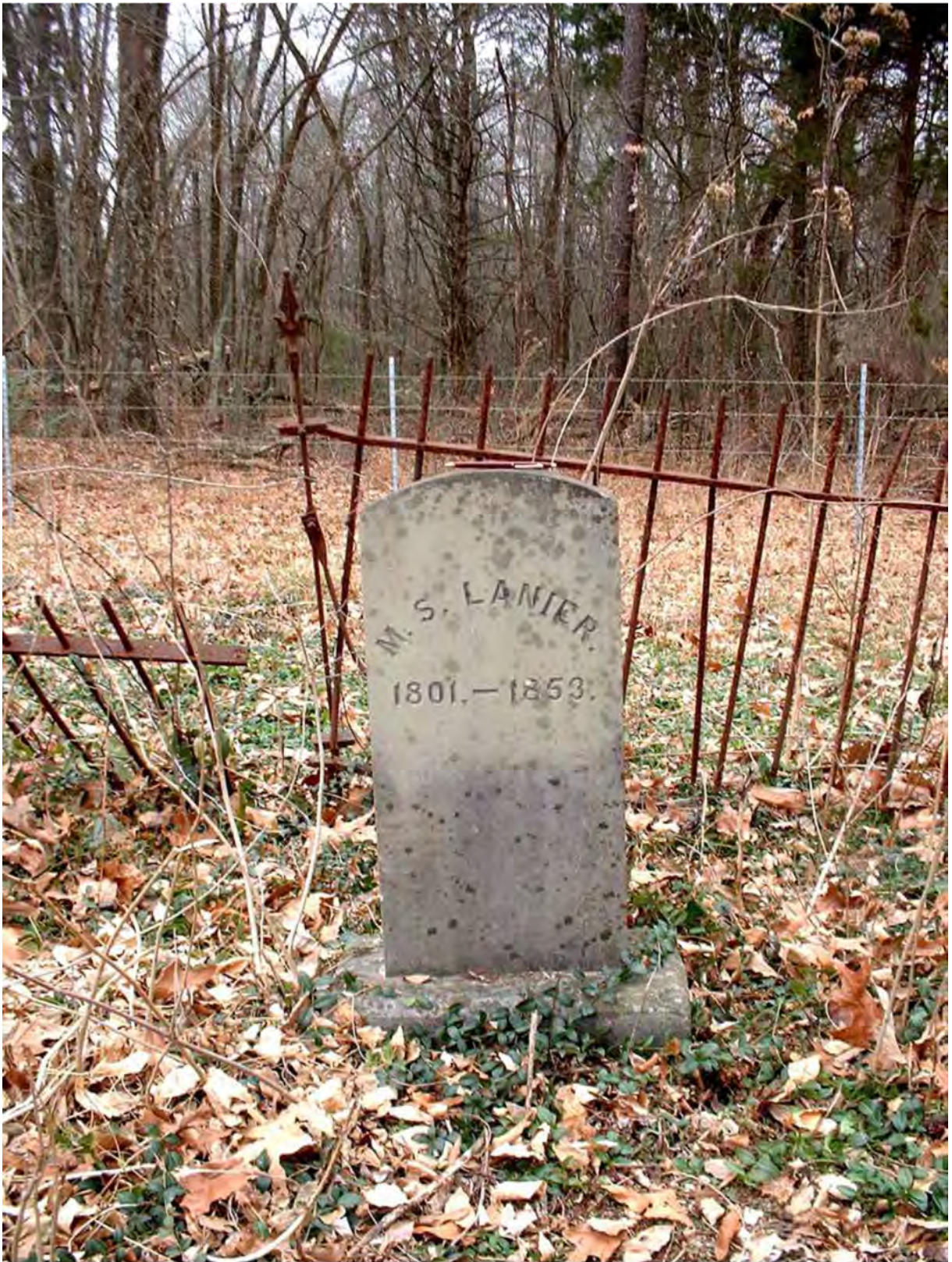
Lanier Cemetery 46-3, Redstone Arsenal, Madison Co. AL, Jan. 28, 2003