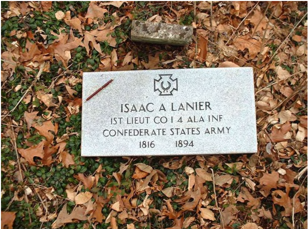
Lanier Cemetery 46-3, Redstone Arsenal, Madison Co. AL, Jan. 28, 2003