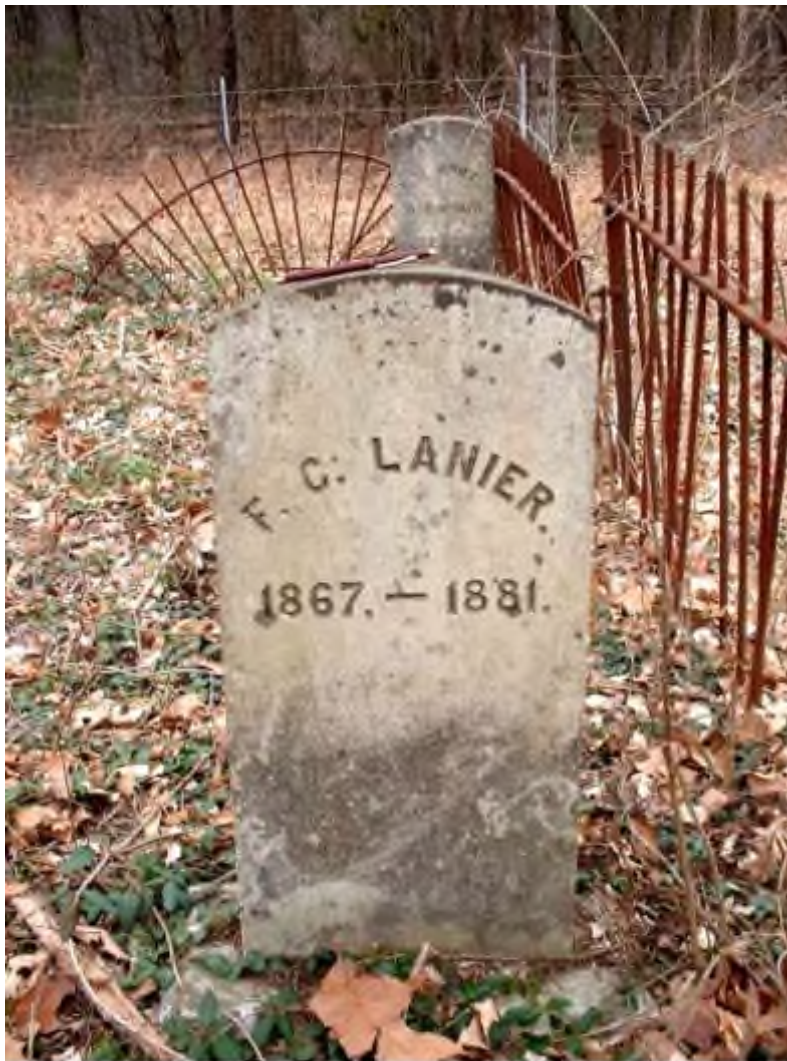
Lanier Cemetery 46-3, Redstone Arsenal, Madison Co. AL, Jan. 28, 2003