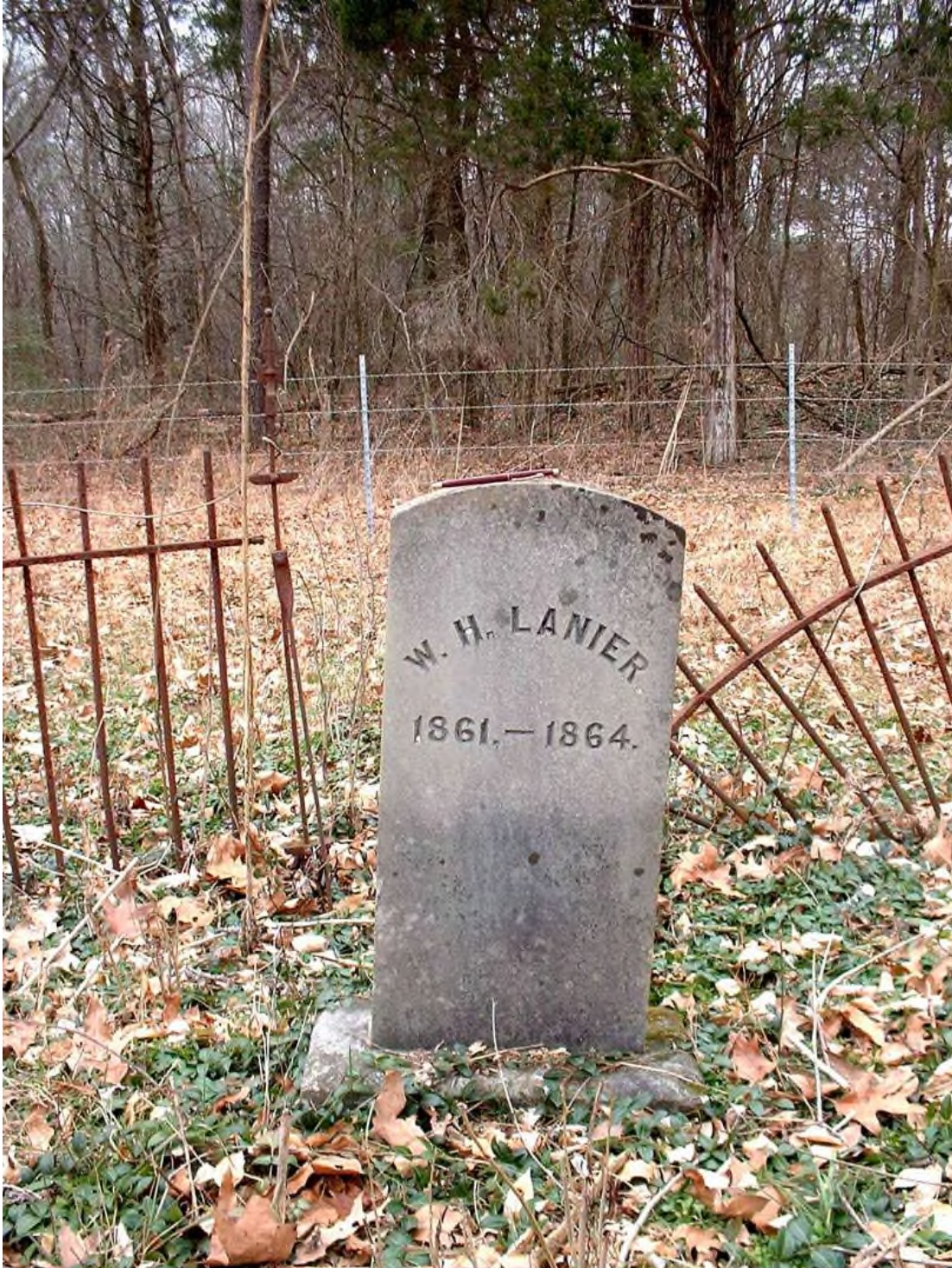
Lanier Cemetery 46-3, Redstone Arsenal, Madison Co. AL, Jan. 28, 2003