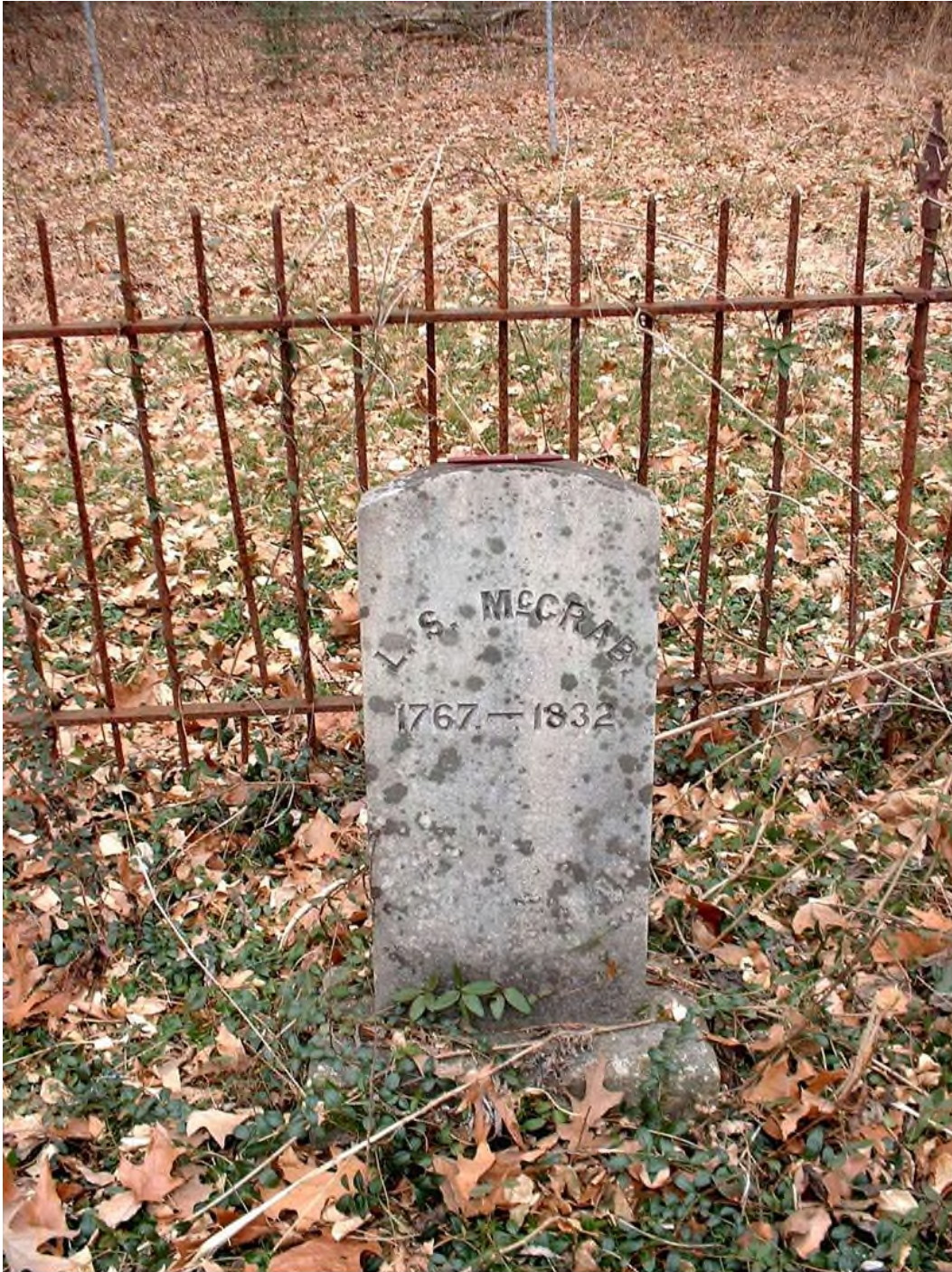
Lanier Cemetery 46-3, Redstone Arsenal, Madison Co. AL, Jan. 28, 2003