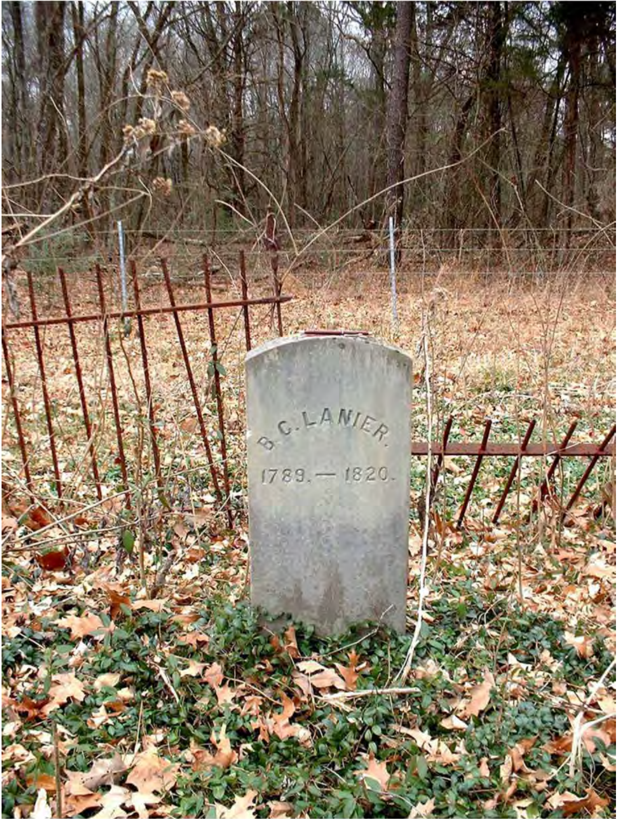
Lanier Cemetery 46-3, Redstone Arsenal, Madison Co. AL, Jan. 28, 2003