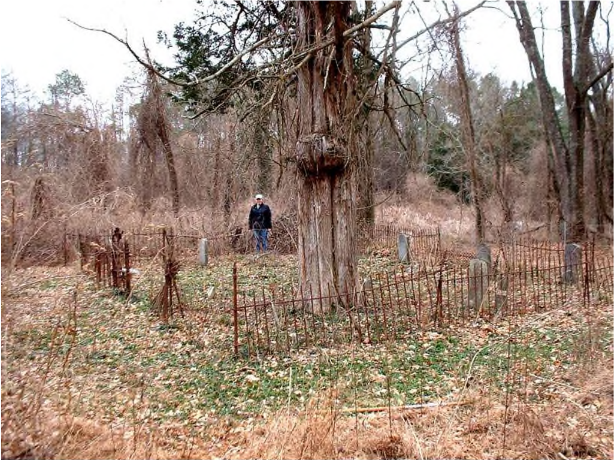
Lanier Cemetery 46-3, Redstone Arsenal, Madison Co. AL, Jan. 28, 2003

This cemetery is located in the northwest corner of Test Area 1, with access allowed only by special protocols during non-test times. It is adjacent to a Hazardous Chemical Area south of the west end of Saturn Road. Access is via a rough trail (ditches, mudholes) through woods along the TA1 north perimeter fence.