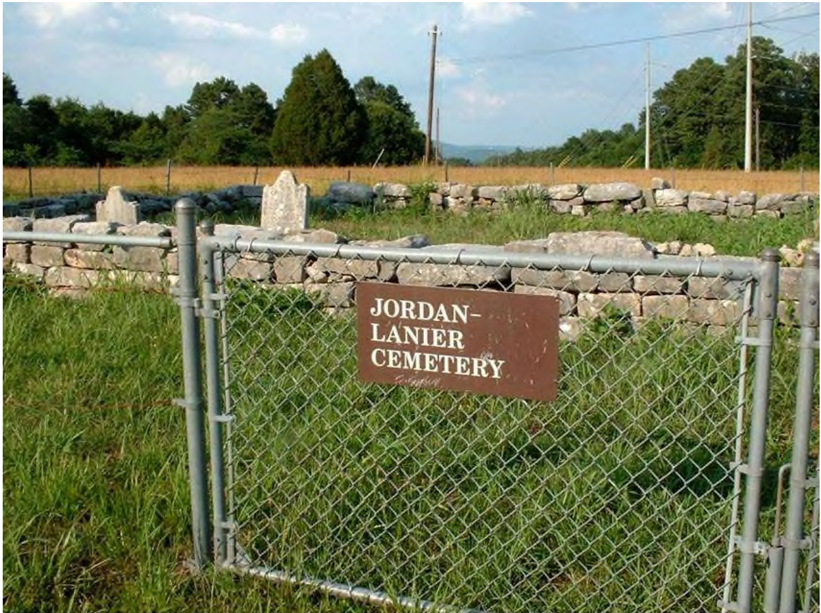
Jordan - Lanier Cemetery, Redstone Arsenal, Madison Co., AL, June, 2002.