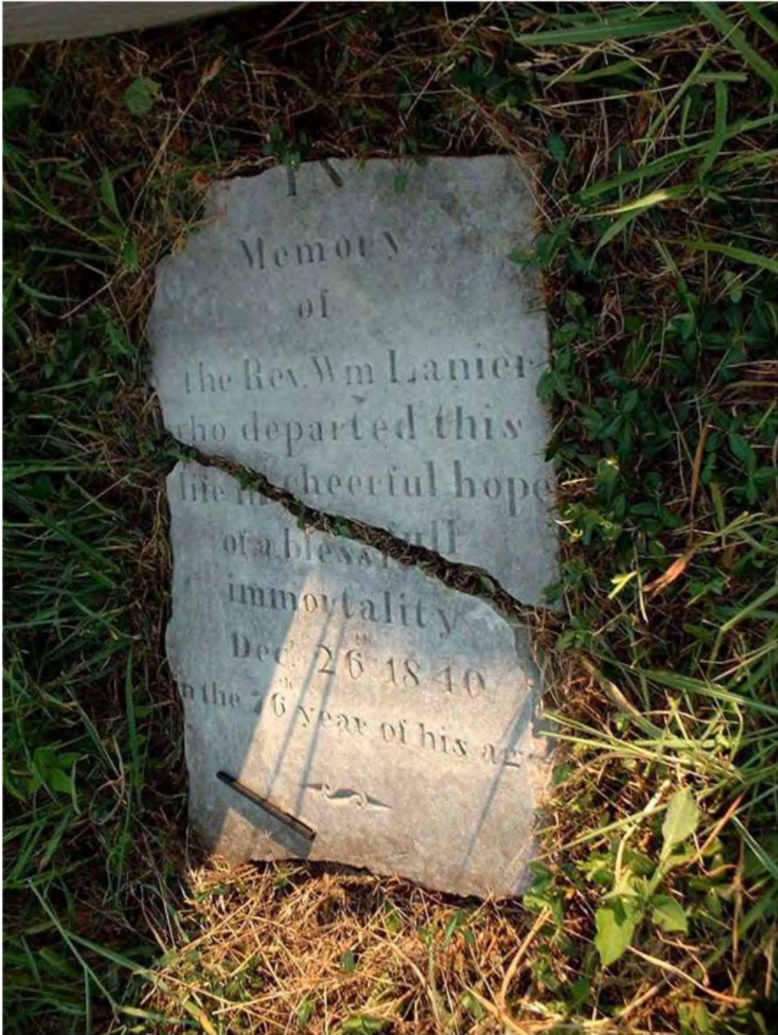
Jordan - Lanier Cemetery, Redstone Arsenal, Madison Co., AL, June, 2002.