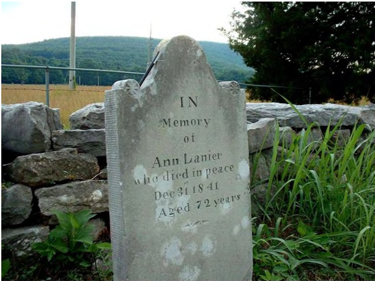
Jordan - Lanier Cemetery, Redstone Arsenal, Madison Co., AL, June, 2002.