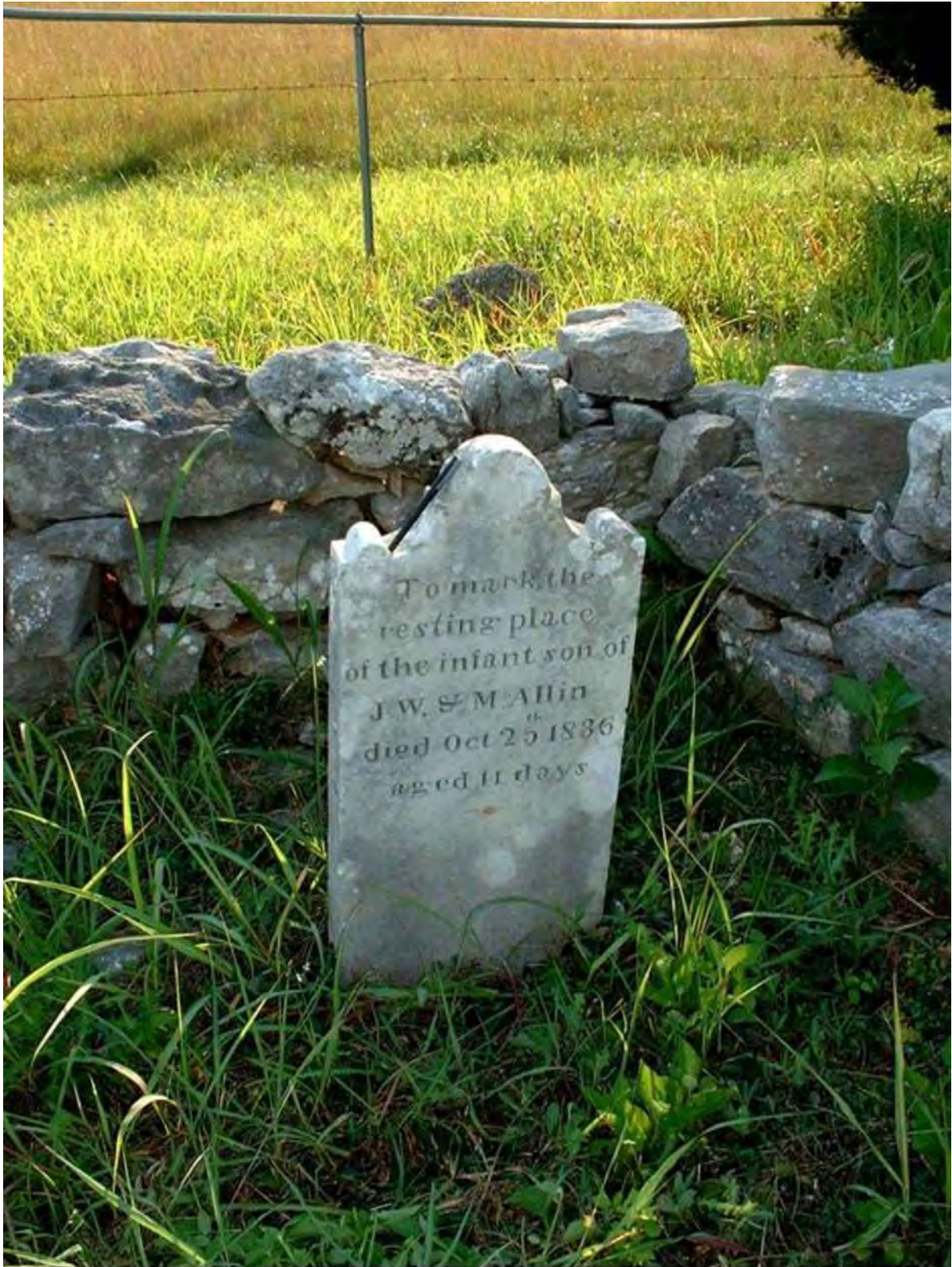
Jordan - Lanier Cemetery, Redstone Arsenal, Madison Co., AL, June, 2002.