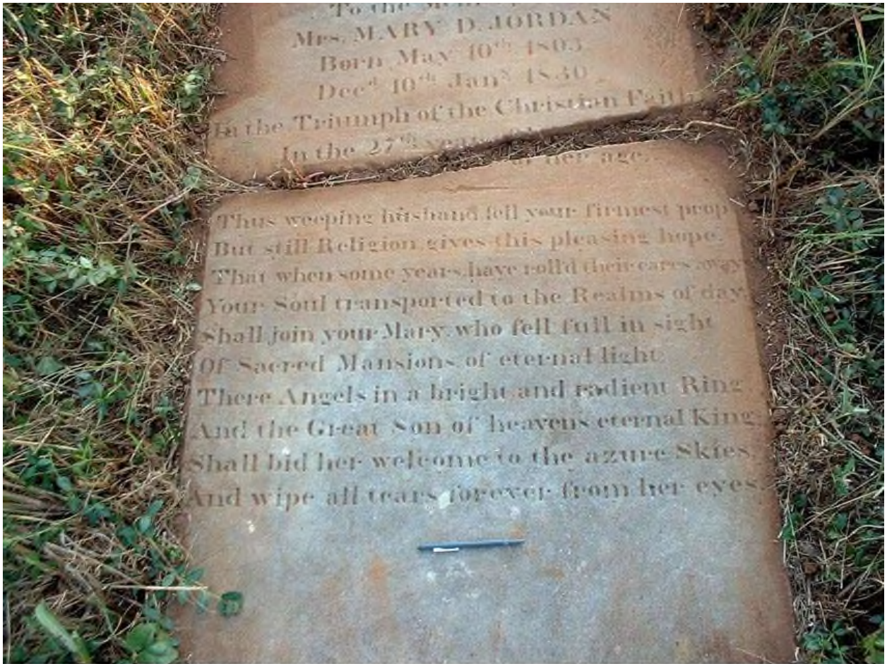
Jordan - Lanier Cemetery, Redstone Arsenal, Madison Co., AL, June, 2002.