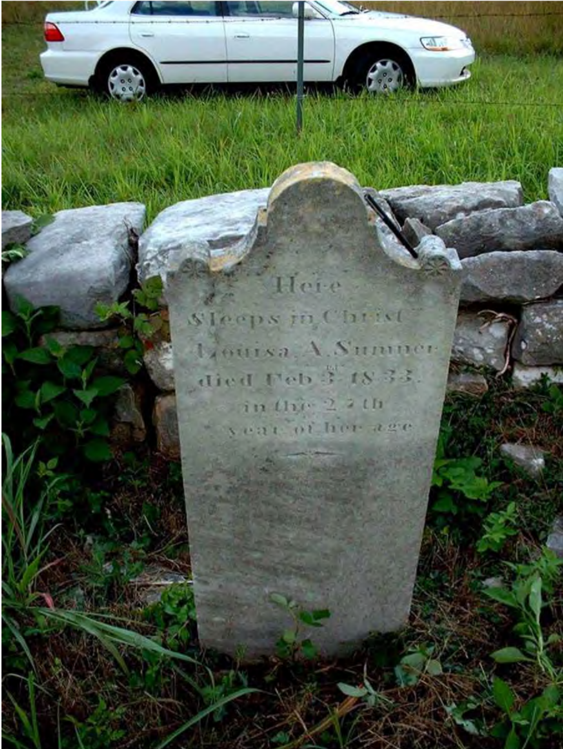
Jordan - Lanier Cemetery, Redstone Arsenal, Madison Co., AL, June, 2002.