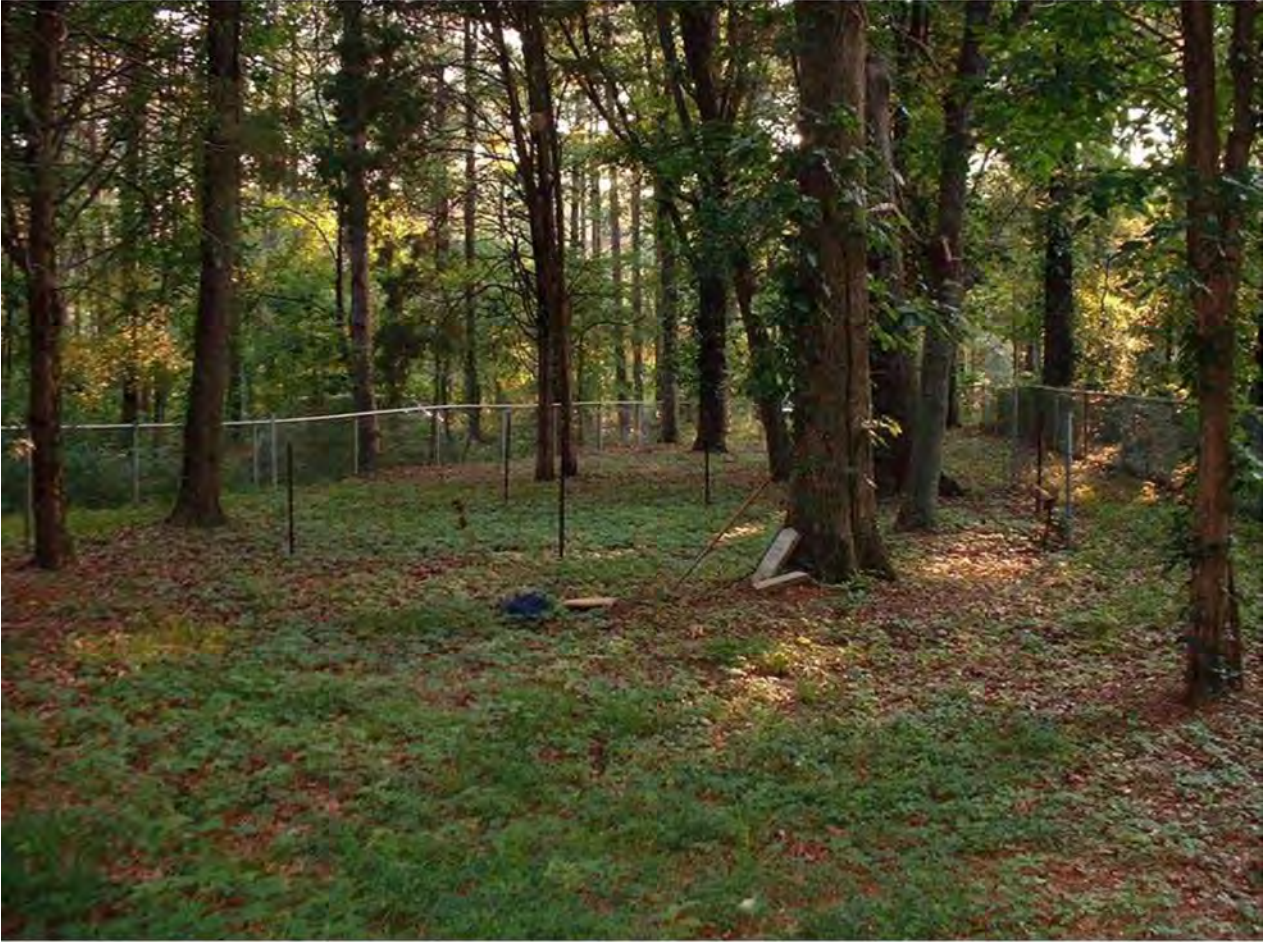
Jordan - Jacobs Cemetery, Redstone Arsenal, Madison Co., AL, June, 2002.

There are numerous rectangular grave depressions evident outside both the east and the west sides of the inner (hogwire) fenced area. The overall size of the cemetery could hold many hundreds of graves, but the depressions are only in evidence at the west end of the cemetery.