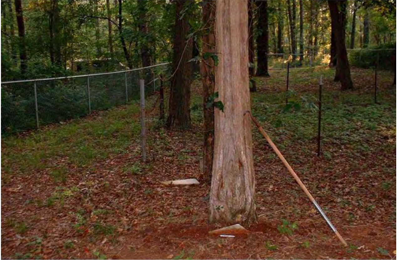
Jordan - Jacobs Cemetery, Redstone Arsenal, Madison Co., AL, June, 2002.