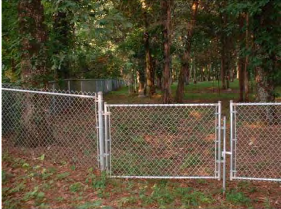
Jordan - Jacobs Cemetery, Redstone Arsenal, Madison Co., AL, June, 2002.

This cemetery is located approximately on the line between S33-T4S-R1W and S4-T5S-R1W.