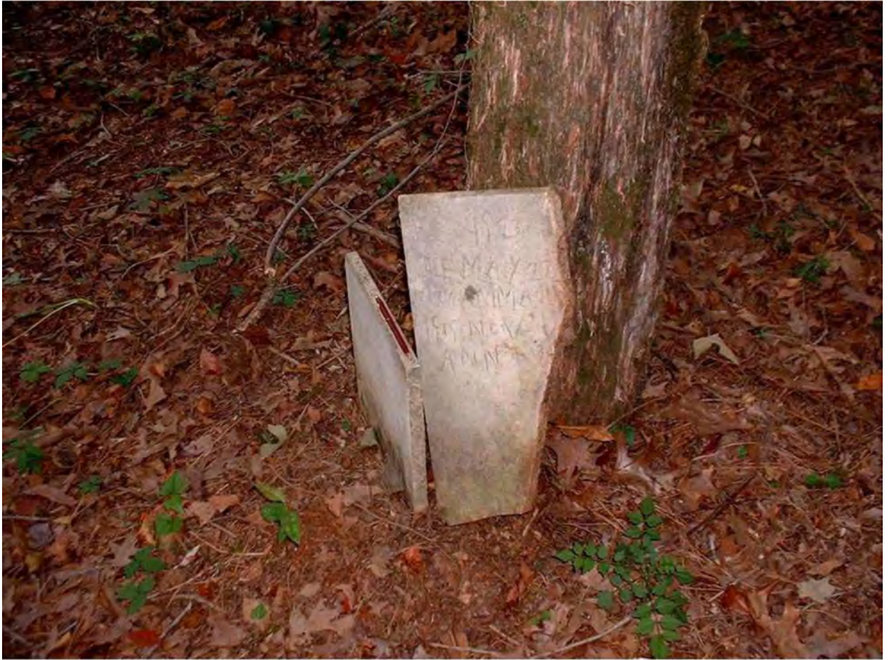
Jordan - Jacobs Cemetery, Redstone Arsenal, Madison Co., AL, June, 2002.

(A closer view of this marker is given below.)