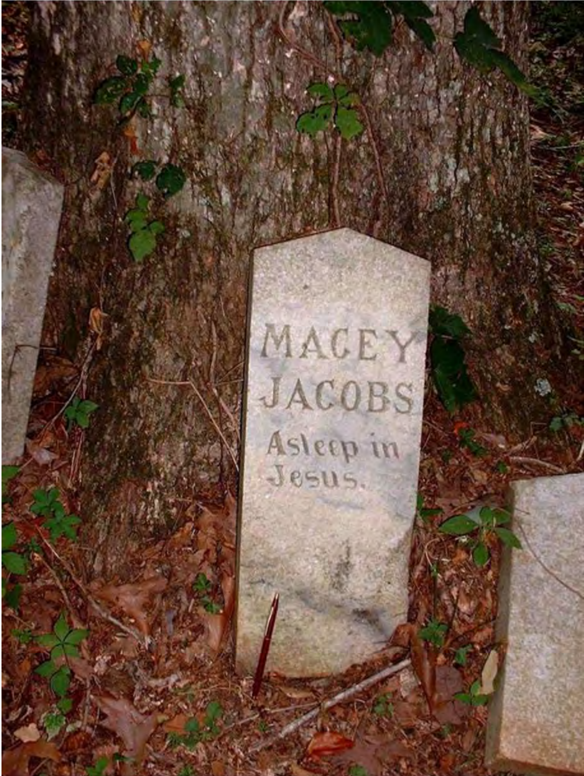
Jordan - Jacobs Cemetery, Redstone Arsenal, Madison Co., AL, June, 2002.