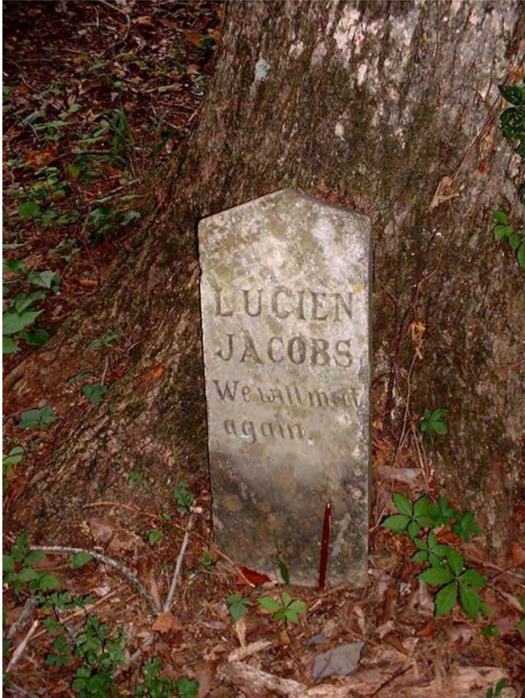
Jordan - Jacobs Cemetery, Redstone Arsenal, Madison Co., AL, June, 2002.