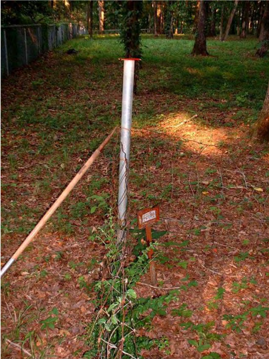
Jordan - Jacobs Cemetery, Redstone Arsenal, Madison Co., AL, June, 2002.

Badly rusted metal funeral home marker. Located in Northeast corner of inner (hogwire) fenced plot near west end of cemetery. No other markers or fieldstones found within inner fenced area.