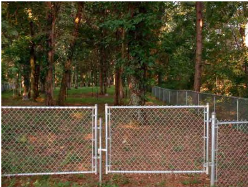
Jordan - Jacobs Cemetery, Redstone Arsenal, Madison Co., AL, June, 2002.

This cemetery is located approximately on the line between S33-T4S-R1W and S4-T5S-R1W.