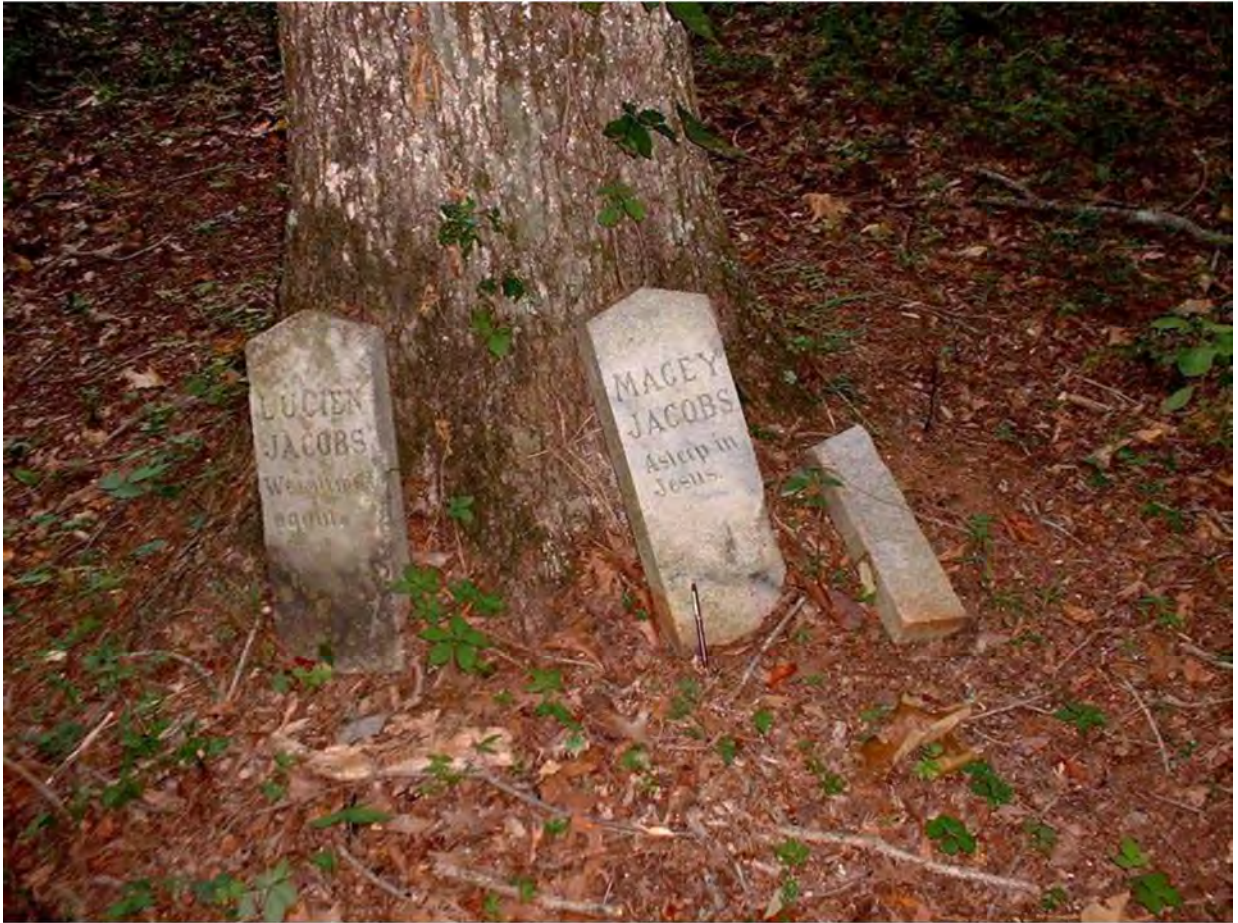
Jordan - Jacobs Cemetery, Redstone Arsenal, Madison Co., AL, June, 2002.