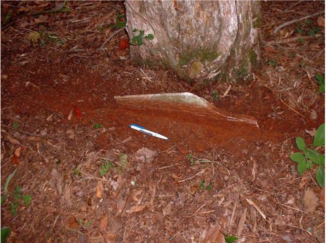
Jordan - Jacobs Cemetery, Redstone Arsenal, Madison Co., AL, June, 2002.

This marker will have to be dug out with a shovel to view both sides clearly in checking for inscriptions. It is firmly buried in very hard clay and could not be extricated with the hoe handle and hook used for the June 2002 visit.