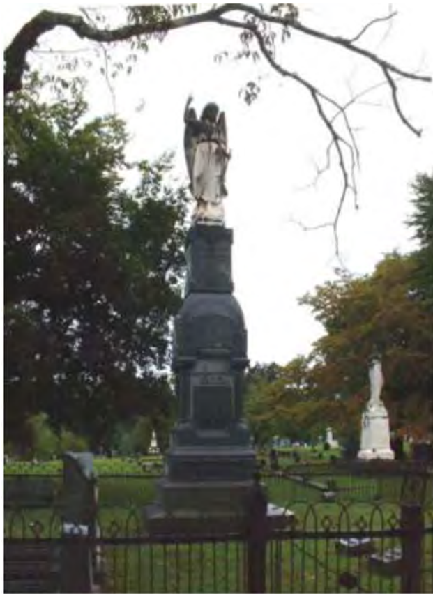
Maple Hill Cemetery (Huntsville, AL), September 7, 2004