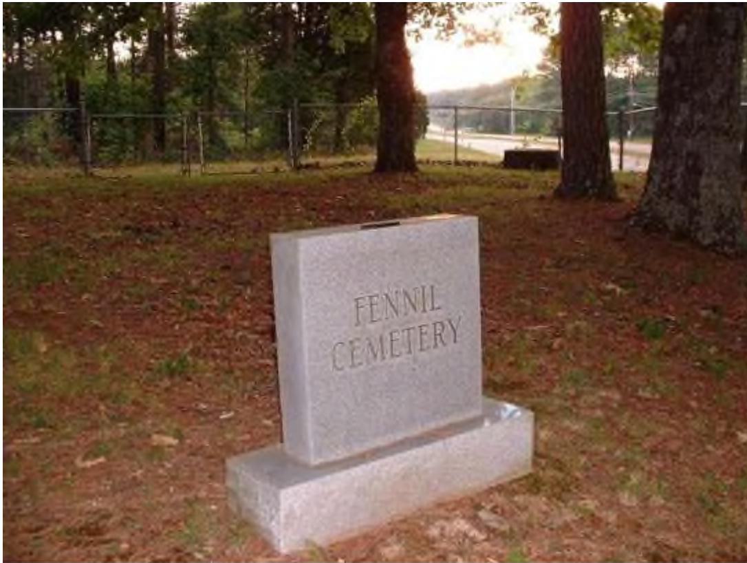
Fennil Cemetery, Redstone Arsenal, Madison Co., AL, June, 2002.

This cemetery is located in the Southeast Quarter of Section 32, Township 4 South, Range 1 West. It forms the southwest corner of the intersection of Mills Road with Martin Road on the arsenal today. The name on the cemetery marker is incorrectly spelled, as the true spelling of the name