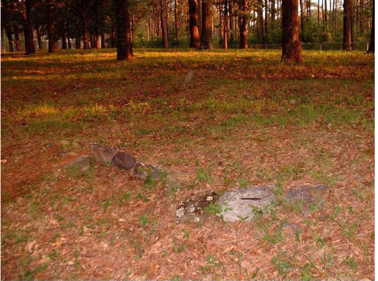
Fennil Cemetery, Redstone Arsenal, Madison Co., AL, June, 2002.

This photo shows an area bounded by stones to possibly denote a family area for burials. There is a leaning tombstone in the upper background, at center.