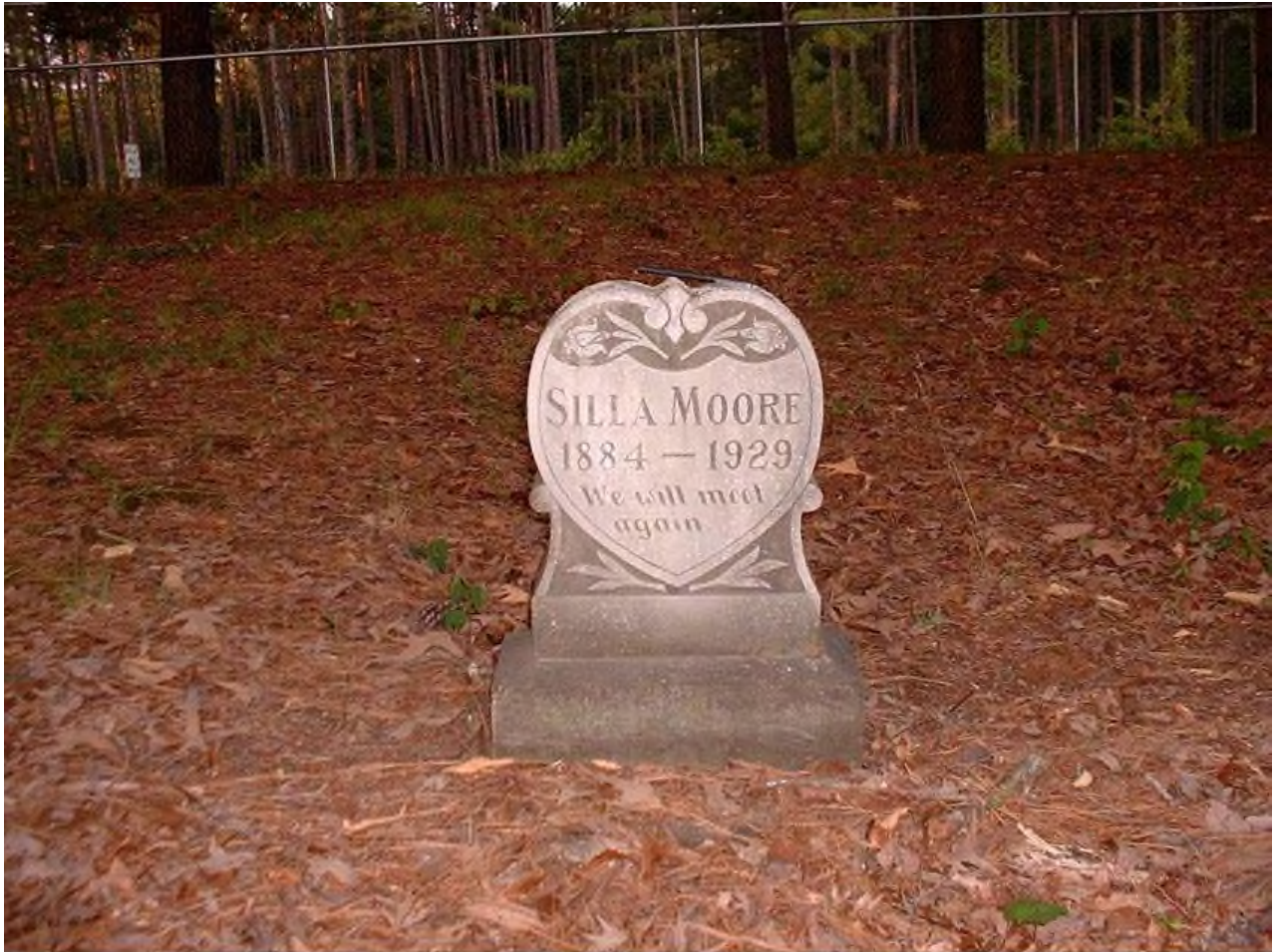
Fennil Cemetery, Redstone Arsenal, Madison Co., AL, June, 2002.