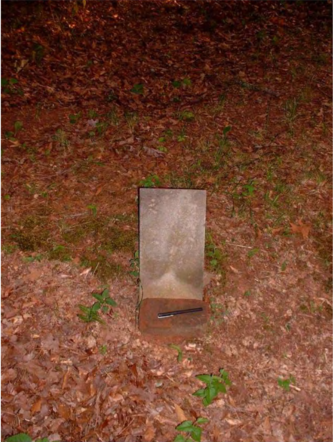
Fennil Cemetery, Redstone Arsenal, Madison Co., AL, June, 2002. This uninscribed rectangular concrete tombstone has a brick at its base.