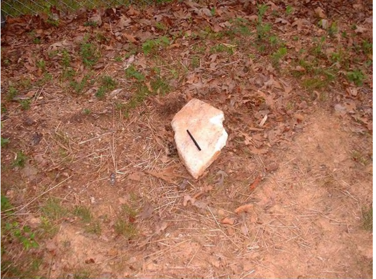
Fennil Cemetery, Redstone Arsenal, Madison Co., AL, June, 2002.

This broken piece of a tombstone contained no inscriptions, but it is located at an obvious gravesite.