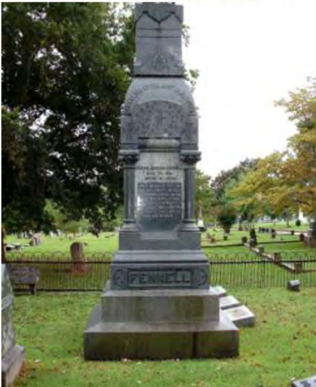
Maple Hill Cemetery (Huntsville, AL), September 7, 2004