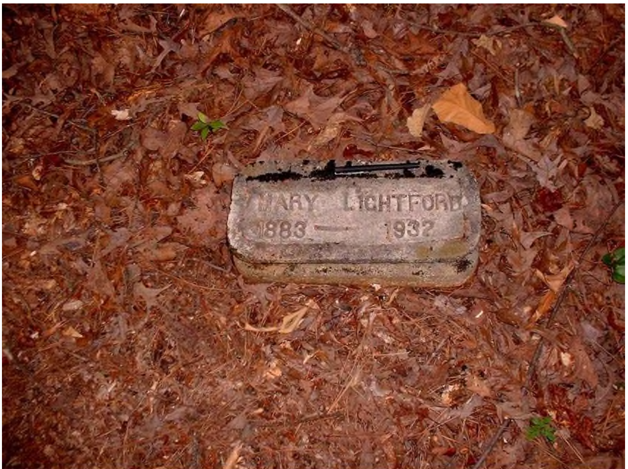
Fennil Cemetery, Redstone Arsenal, Madison Co., AL, June, 2002.