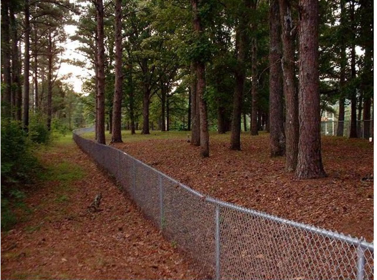
Fennil Cemetery, Redstone Arsenal, Madison Co., AL, June, 2002.

This overview from the southwestern portion of the cemetery perimeter looks toward the intersection of Martin Road with Mills Road, which can be seen as the traffic light in the background. Careful inspection of the photo will show the tombstone of Silla Moore in the center of the picture, very near the base of a pine tree.