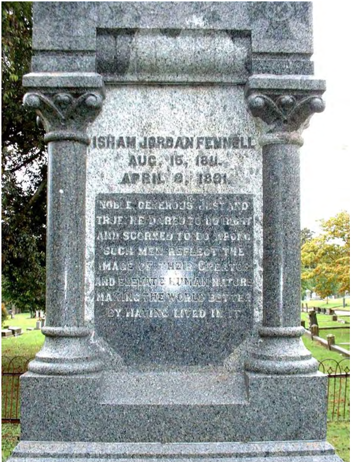
Maple Hill Cemetery (Huntsville, AL), September 7, 2004