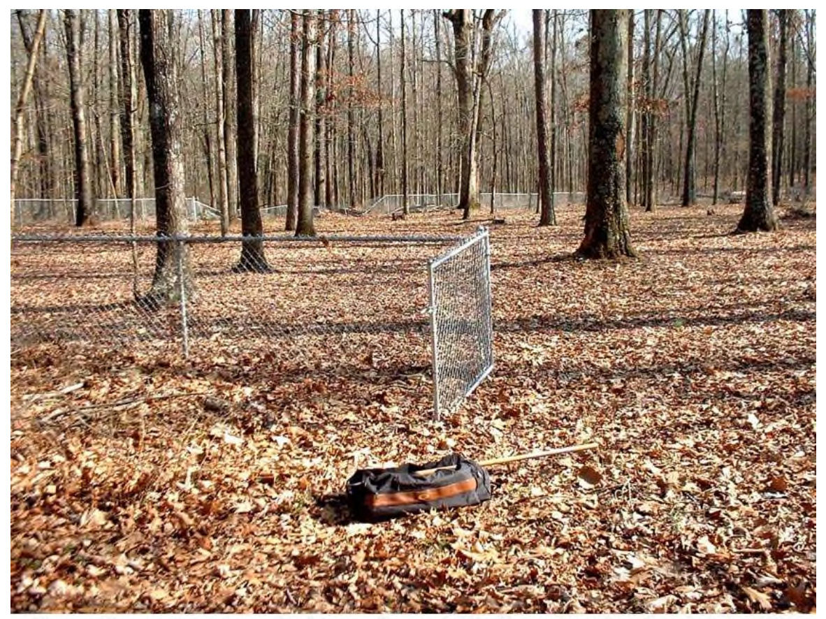
Green Grove Cemetery, Redstone Arsenal, Madison Co. AL., March 11, 2003 Entrance gate, fence damage in background

This cemetery is located in the southwest quarter of Section 14, Township 4 South, Range 2 West. It is abut a quarter mile south of Interstate 565 and perhaps one eighth mile west of Anderson Road. Today Anderson Road no longer crosses the arsenal northern boundary to connect to the southern end of Slaughter Road, as it once did before the boundary fence and Highways 20 and I-565 severed the connection. From the northern end of Anderson Road on the arsenal, one can follow the fence line west until finding a southgoing security fence line, which can be followed toward the cemetery. The cemetery is on a slope that goes down to a small creek that becomes Betts Spring Branch to the south. It may be easier to access the cemetery during