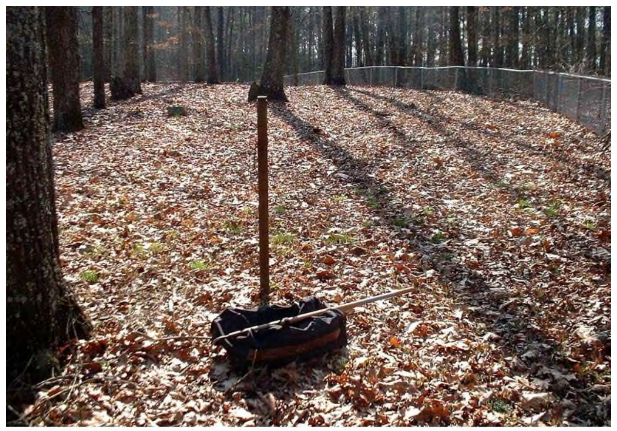
Green Grove Cemetery, Redstone Arsenal, Madison Co. AL, March 11, 2003 Old metal post near entrance gate; tombstone to left of top of post, in background

The post may have been an old sign post to hold the name of the cemetery. It does not appear to be substantial enough to have been a gate post, and there was no evidence of an internal fence in this area of within the cemetery.