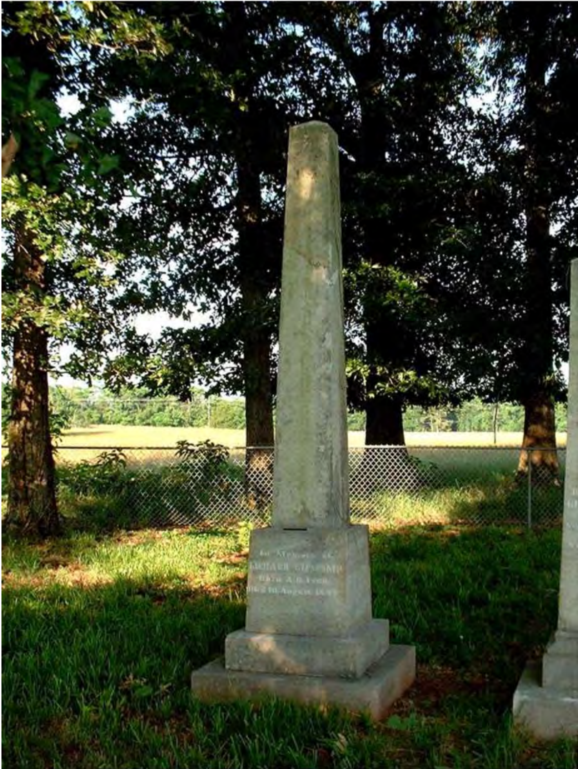
Redstone Arsenal: Lipscomb Cemetery, June, 2002.