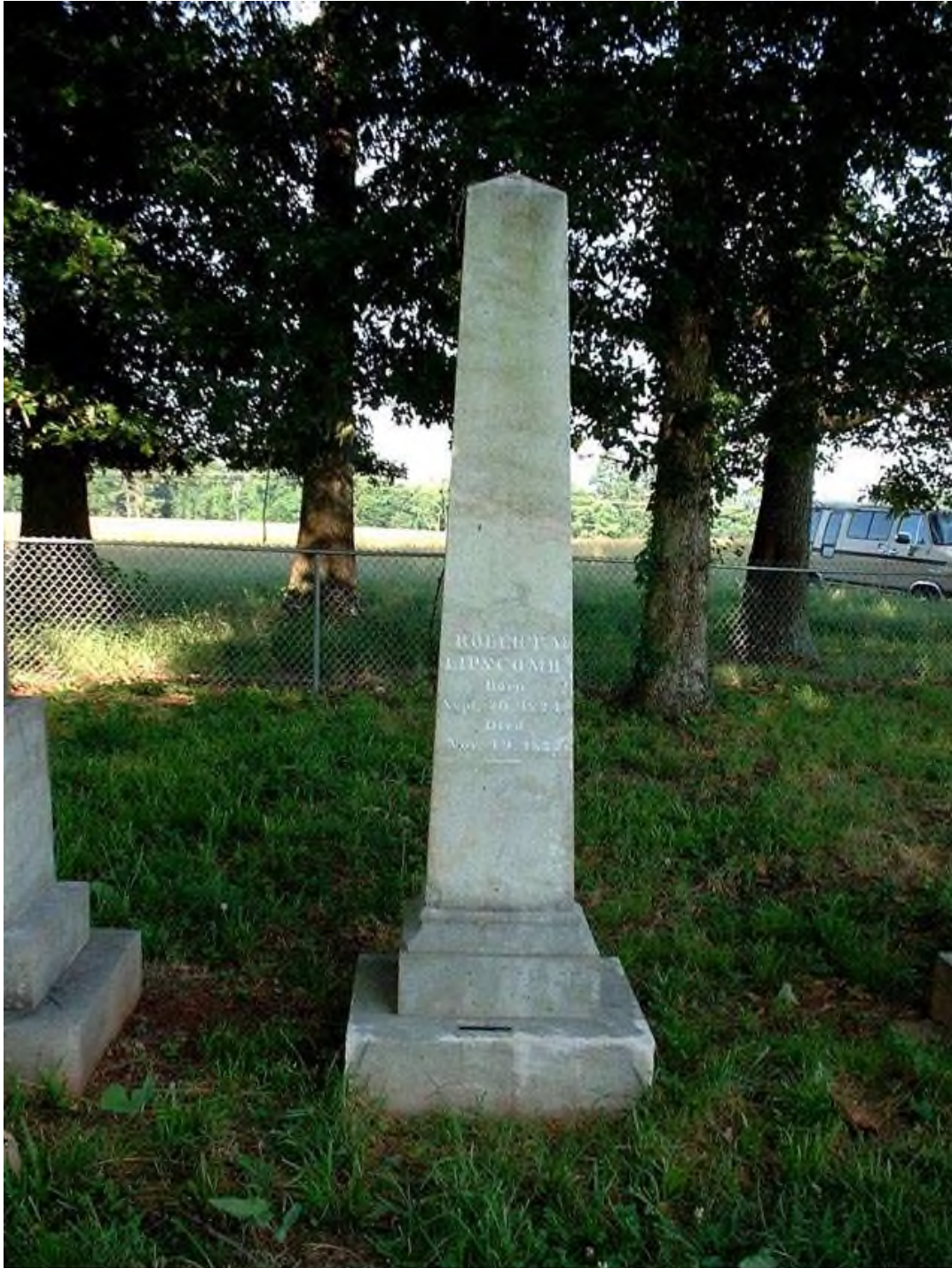
Redstone Arsenal: Lipscomb Cemetery, June, 2002.