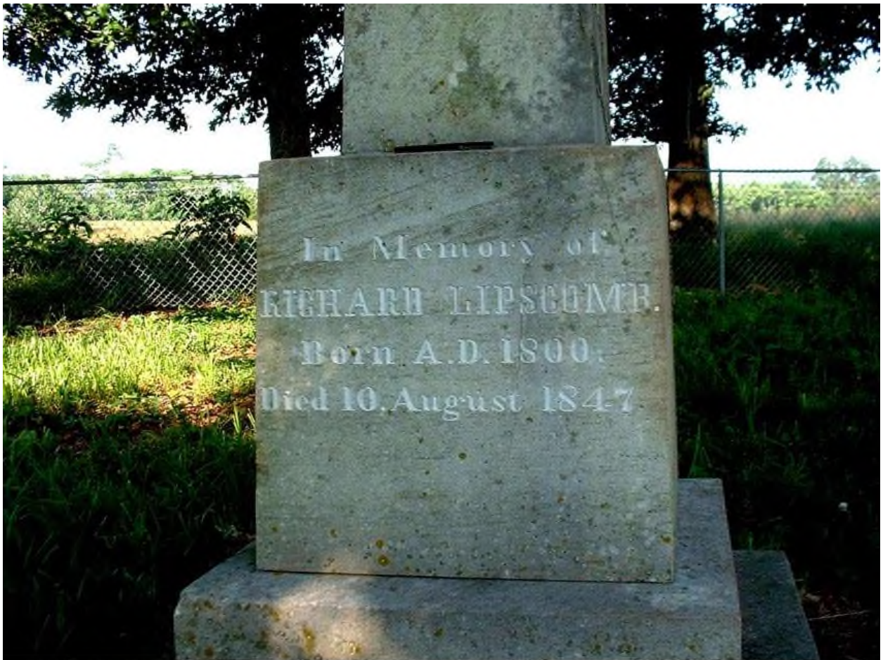
Redstone Arsenal: Lipscomb Cemetery, June, 2002.