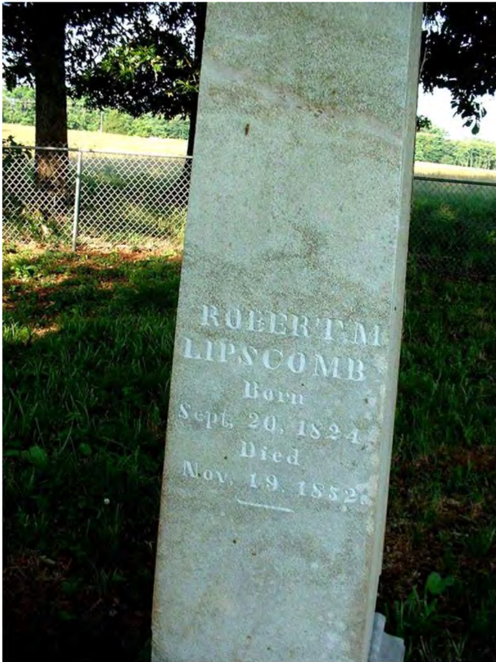
Redstone Arsenal: Lipscomb Cemetery, June, 2002.