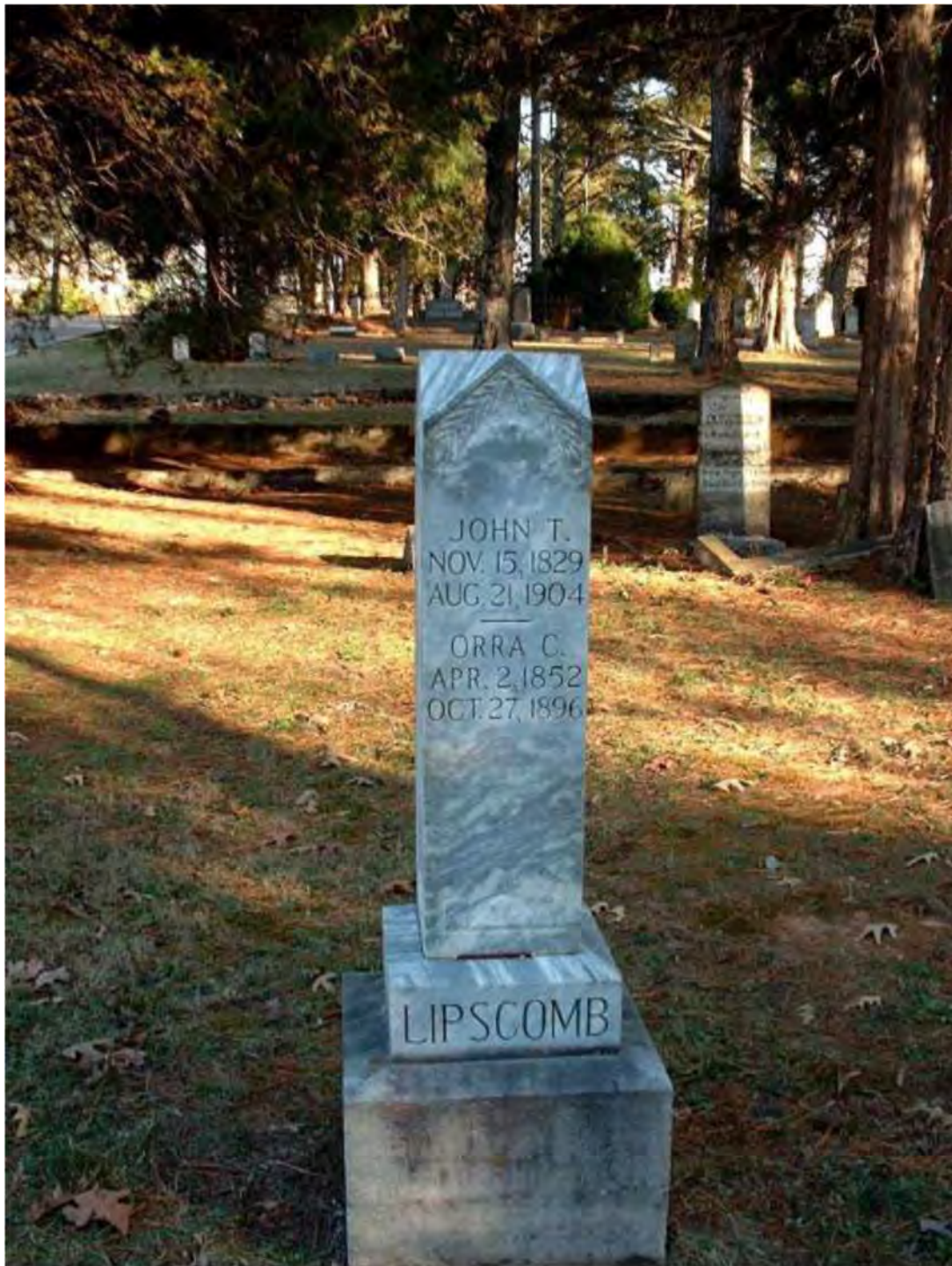
Old section, Madison City Cemetery, Dec. 2001. Westmoreland - Lipscomb - Cartwright area beside Mill Rd.