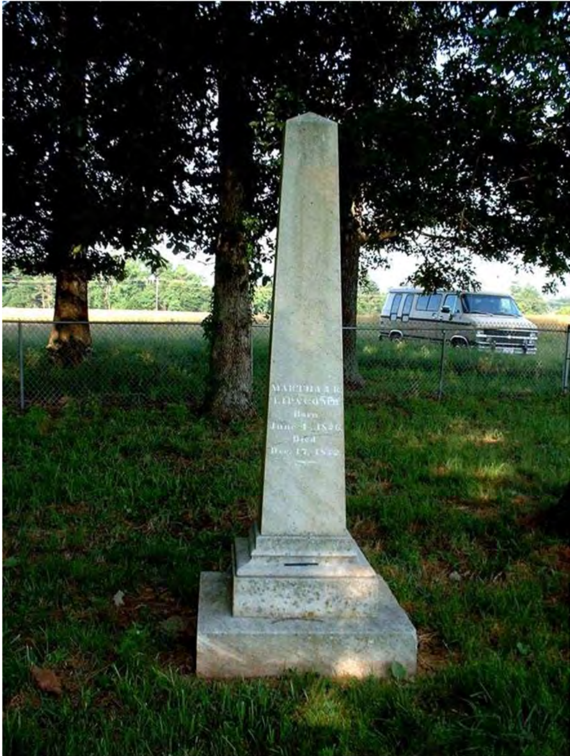
Redstone Arsenal: Lipscomb Cemetery, June, 2002.