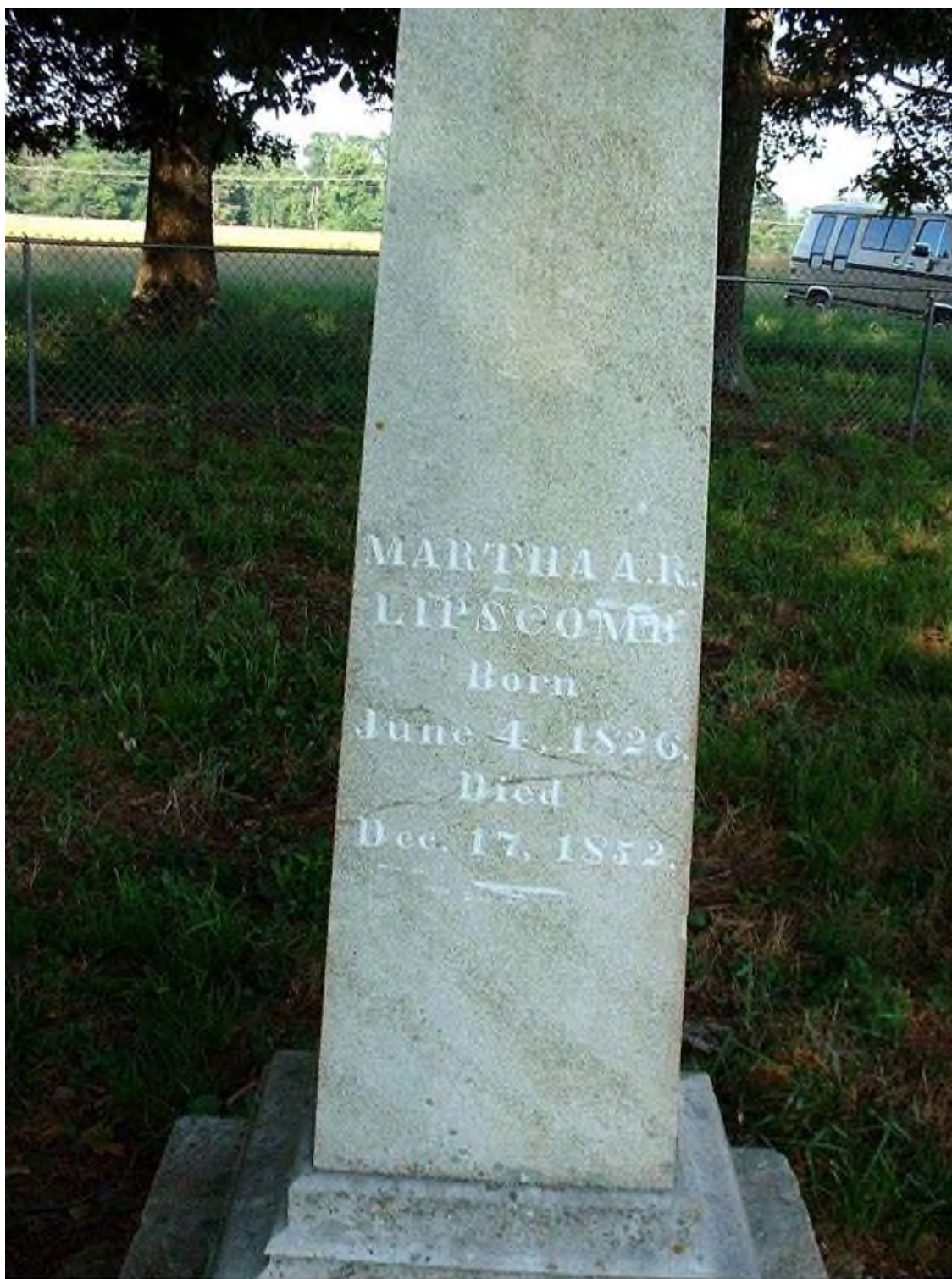
Redstone Arsenal: Lipscomb Cemetery, June, 2002.

The close death dates for Martha and Robert may indicate an epidemic of some type affected the family, but usually epidemics were in the summers.