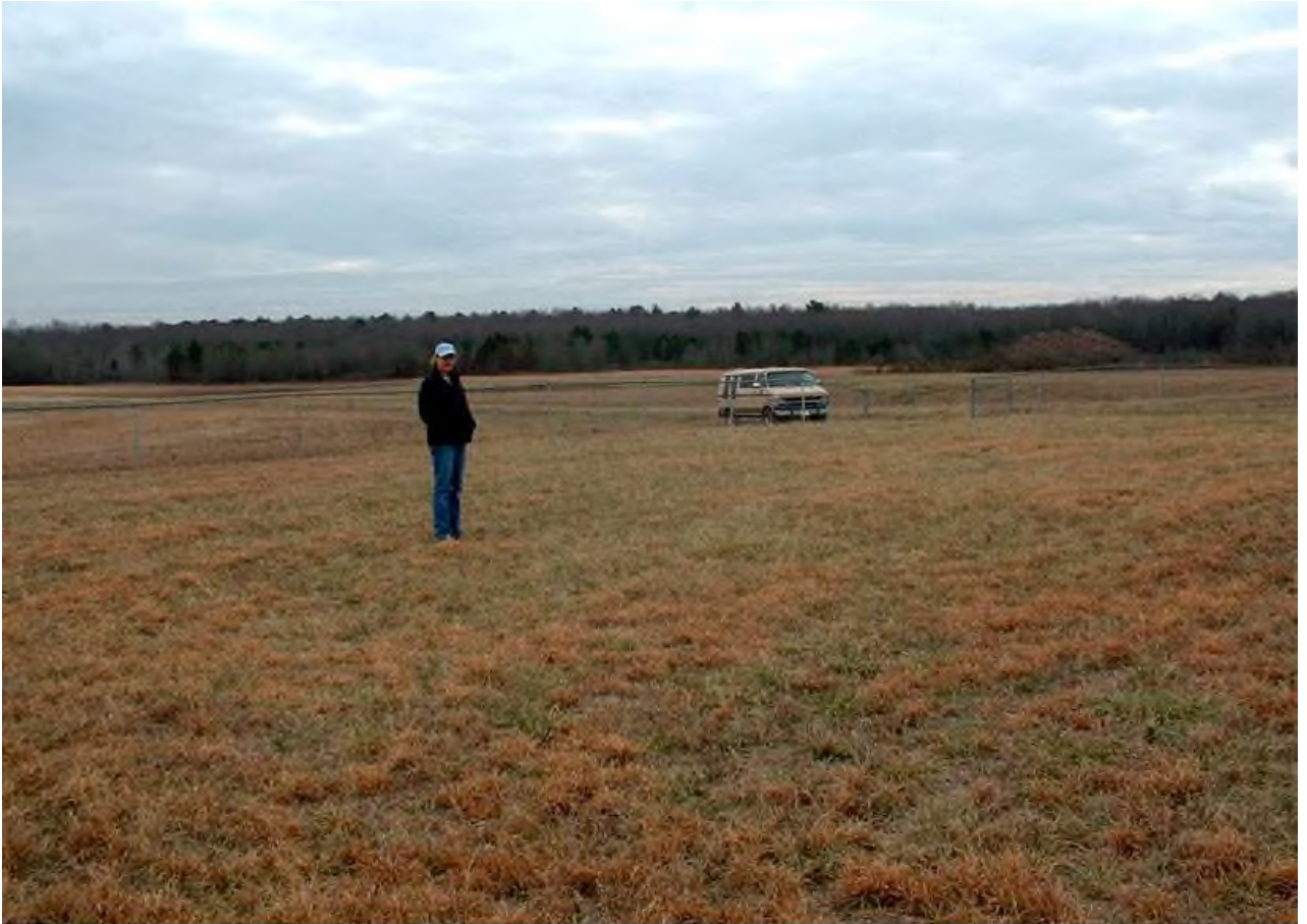
Overview to South-Southeast within UNNAMED CEMETERY in Test Area 1, NW/4, S17-T5S-R1W

When this cemetery was visited in January of 2003, it was found to have no tombstones, no fieldstones, and no surface evidence of grave depressions. It is a large, fenced area that could contain many hundreds of graves, if full. The location is within Test Area 1, south of Center Line Road, about halfway to Dodd Road from the entrance at the Test Area Control Gate. It is near the Clark Cemetery (65-1) and the Simpson – Jones Cemetery (65-3). The immediate theory due to location and lack of definitive surface features