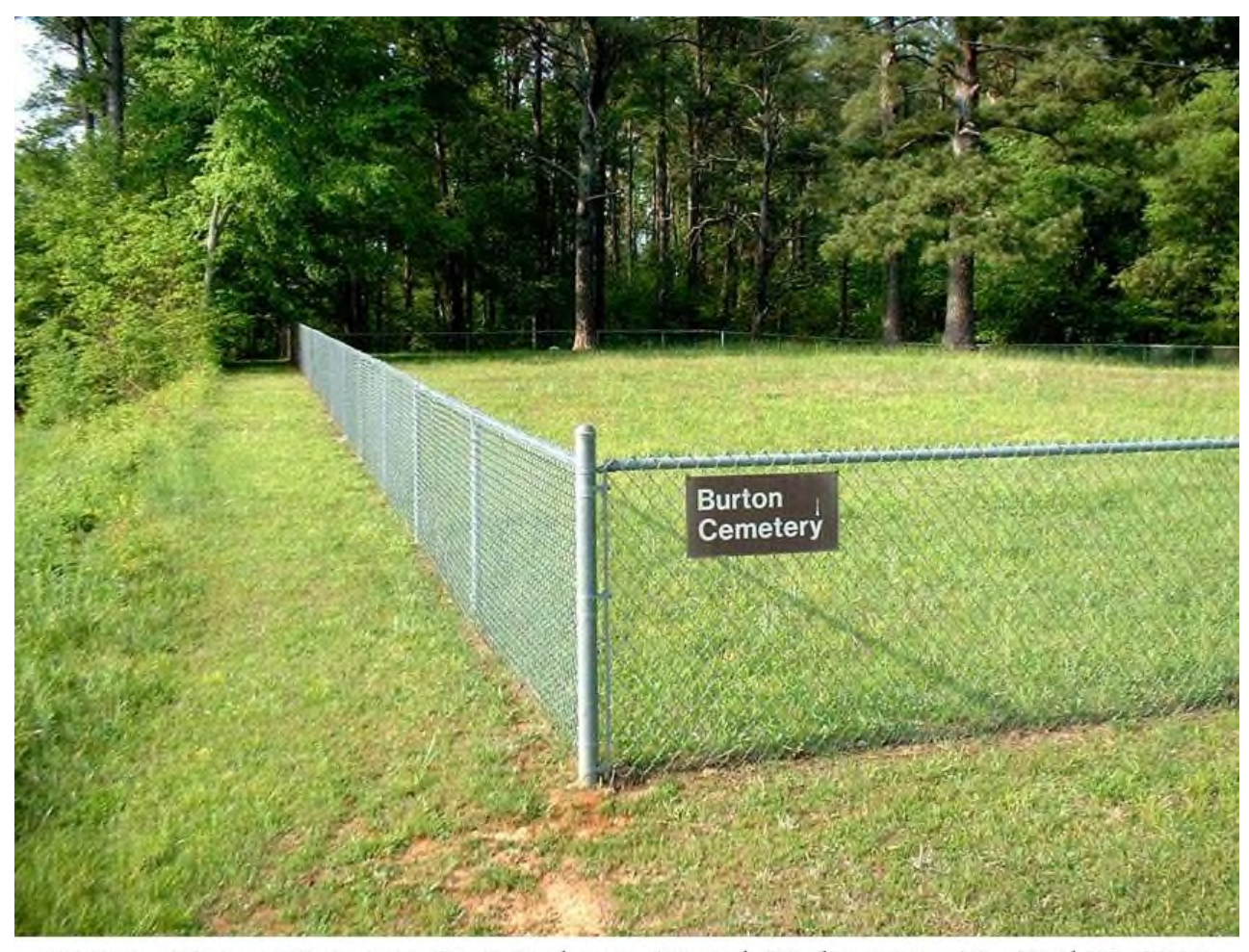
Burton - Morton Cemetery, 71-1, Redstone Arsenal, Madison Co. AL, April 28, 2003 No inscribed tombstones found

This cemetery is located in the east side of the arsenal, on the north shoulder of Redstone Road. As the caption of the above photo states, there are no inscribed tombstones above ground today. Accordingly, those who may be buried in this cemetery are unknown, leading to the assumption that this may a "black cemetery" due to the commonly encountered condition of few or no