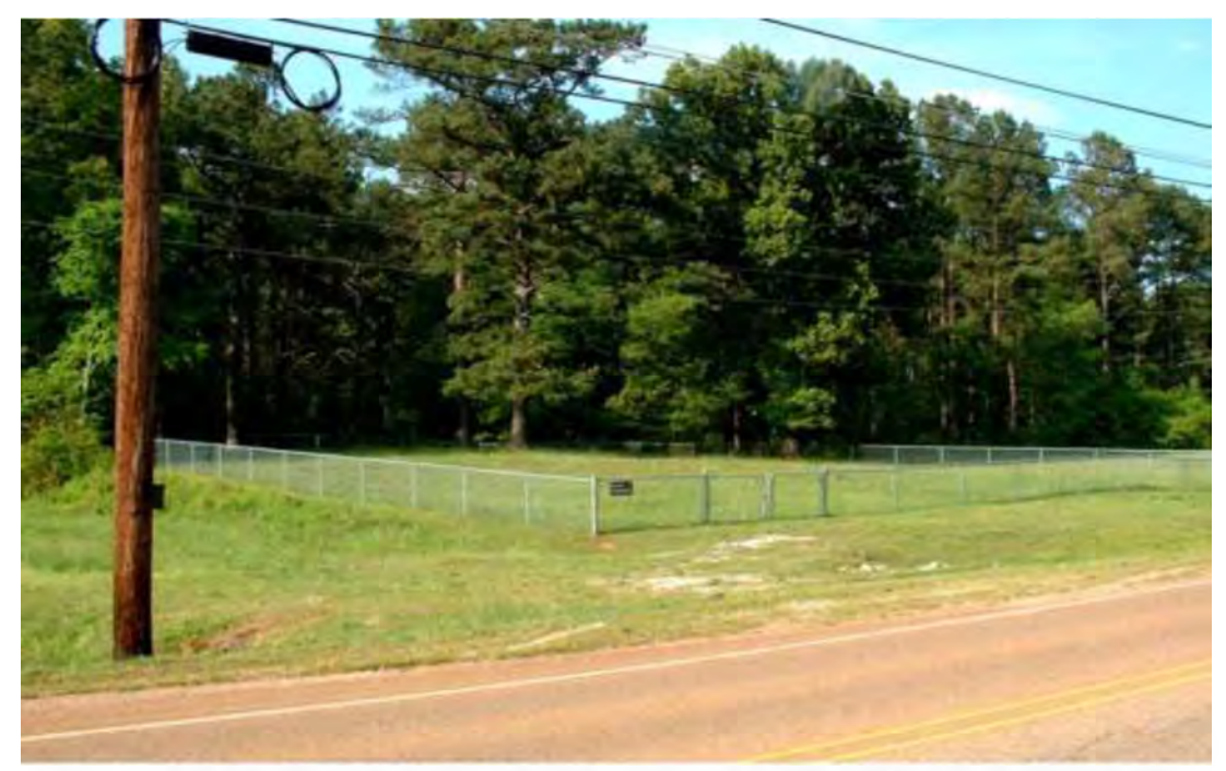
Burton - Morton Cemetery, 71-1, Redstone Arsenal, Madison Co. AL, April 28, 2003