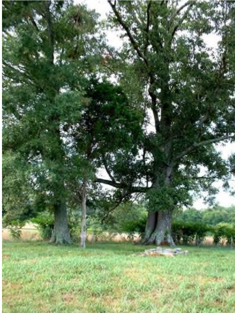
Smith Cemetery (72-2), Redstone Arsenal, Madison County, Alabama, July 2002.