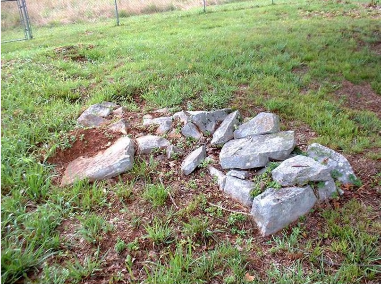
Smith Cemetery (72-2), Redstone Arsenal, Madison County, Alabama, July 2002.