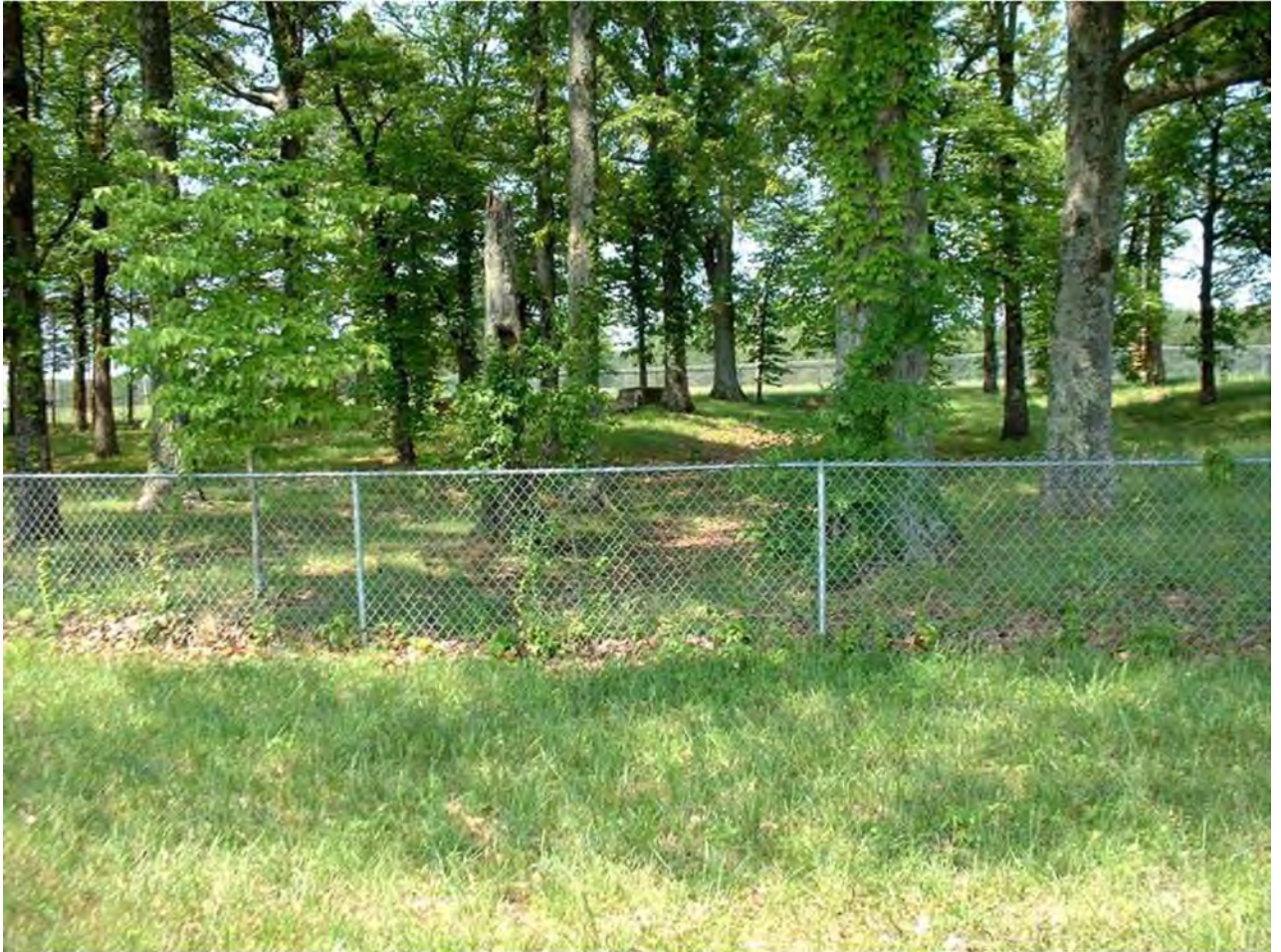
Lacy Cemetery, 75-1, Redstone Arsenal, Madison Co. AL, May 1, 2003 Note box crypt under trees on south side of drainage ditch through cemetery. Four uninscribed stones marking graves were found in this cemetery which can hold around 250 to 300 graves if full. However, only about 20 obvious grave depressions were located. These were mostly near the north end of the cemetery.

Prepared by John P. Rankin, August 12, 2005.