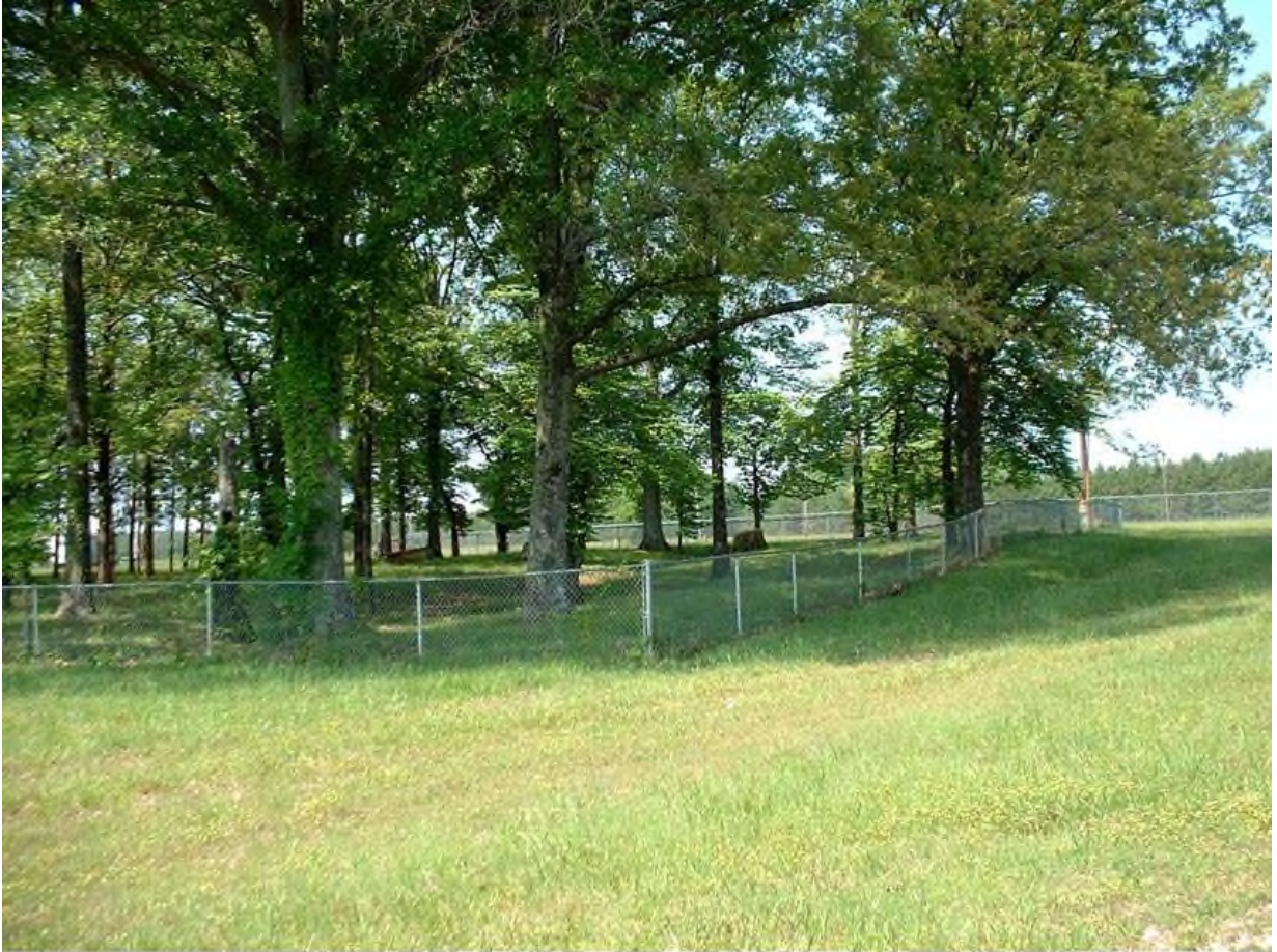
Lacy Cemetery, 75-1, Redstone Arsenal, Madison Co. AL, May 1, 2003 Large stump to right of center, box crypt to left of center

At the time of the 2003 visit to this cemetery, it was within the bounds of a highly secure area. Therefore, casual or impromptu visits are not allowed. The cemetery is the resting place of some of the early pioneer families of Madison County. It is found at the line between Sections 13 and 14 of