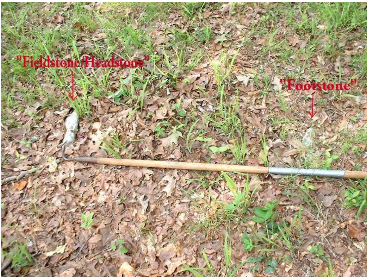
Lacy Cemetery, 75-1, Redstone Arsenal, Madison Co. AL, May 1, 2003 Child-sized grave east of box crypts, along south side of drainage area.