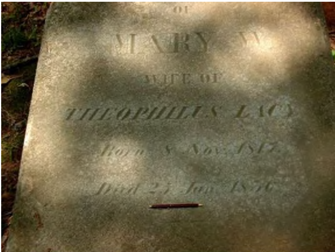
Lacy Cemetery, 75-1, Redstone Arsenal, Madison Co. AL, May 1, 2003