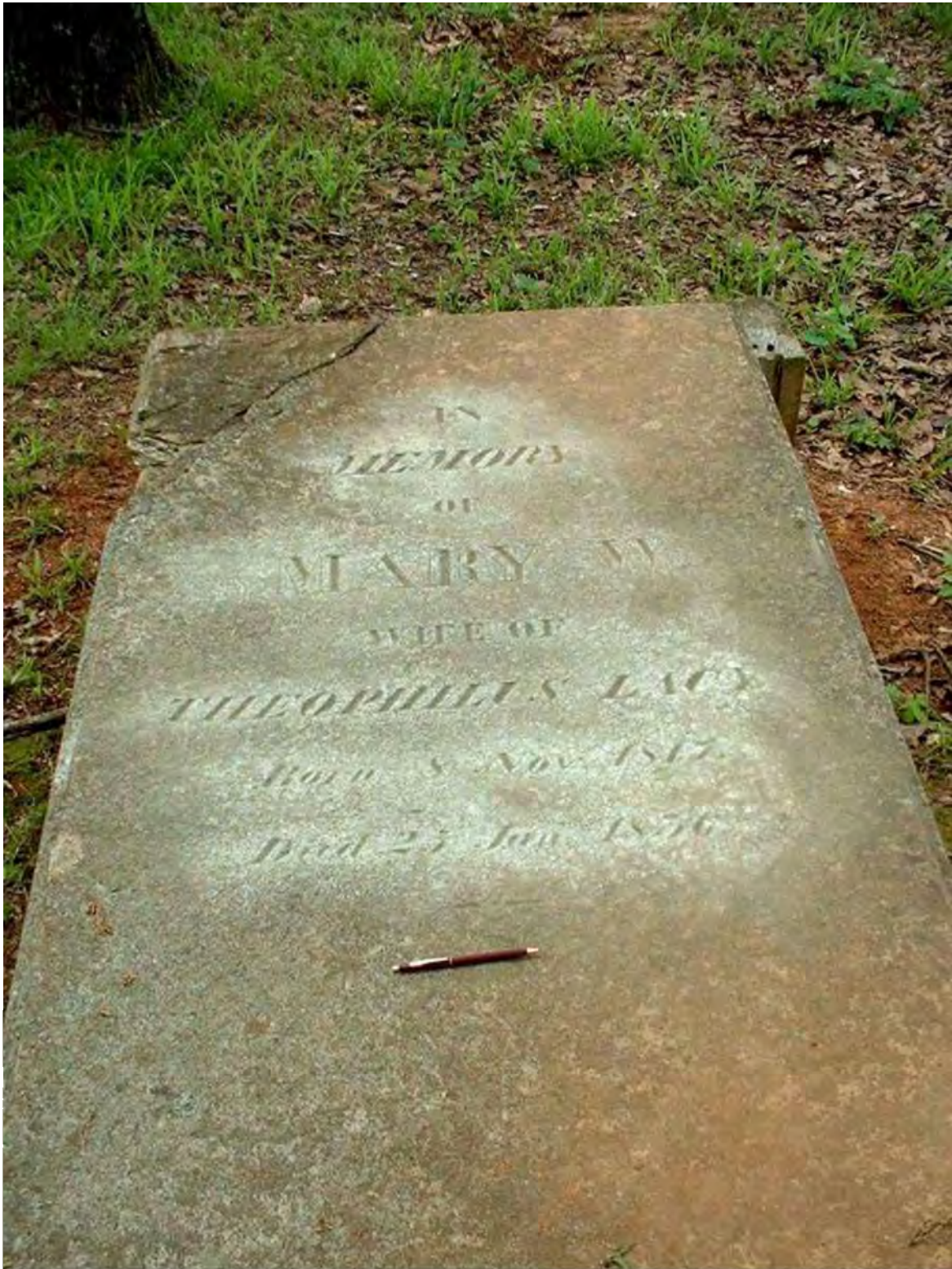
Lacy Cemetery, 75-1, Redstone Arsenal, Madison Co. AL, May 1, 2003