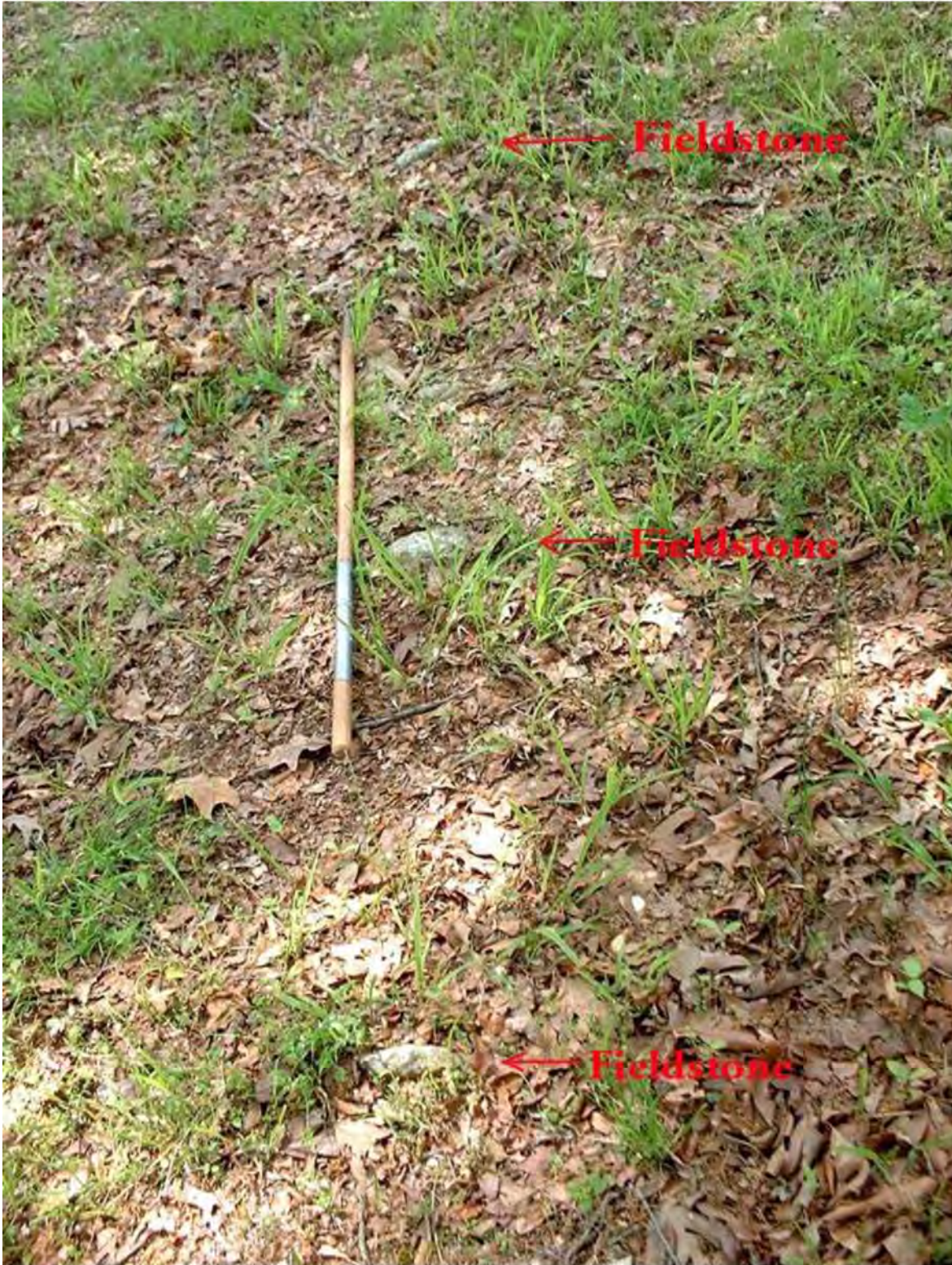
Lacy Cemetery, 75-1, Redstone Arsenal, Madison Co. AL, May 1, 2003 Grave depressions associated with these fieldstones were apparent to the eye, if not to the camera. These graves were located toward the eastern side of the cemetery, along the southern edge of the drainage area through the north end of the cemetery.