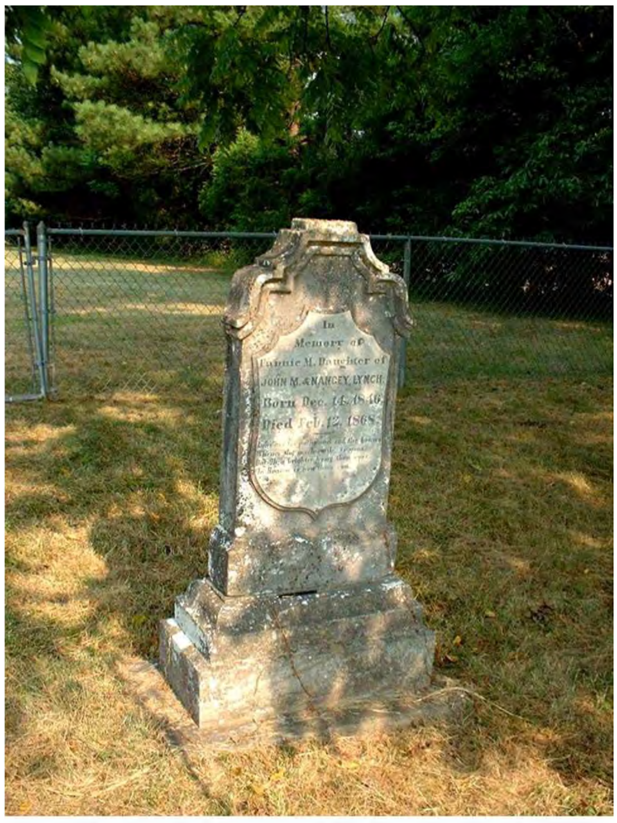
Lynch Cemetery, Redstone Arsenal, Madison Co., AL, July, 2002.