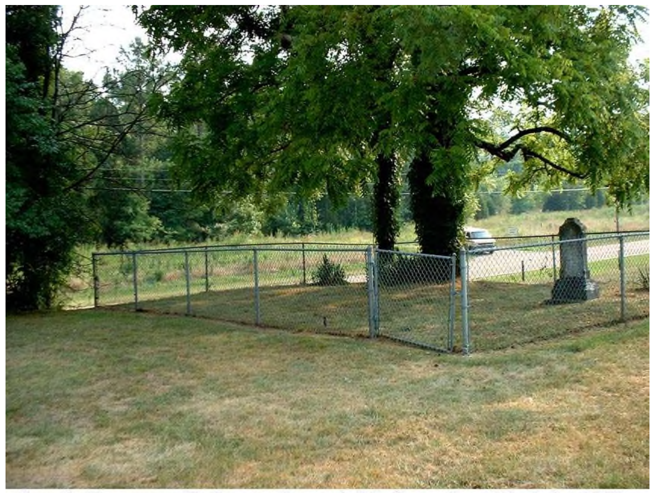
Lynch Cemetery, Redstone Arsenal, Madison Co., AL, July, 2002.

View toward the southwest, overlooking Buxton Road, just west of the junction with McAlpine Road. Van in background is parked at igloo pond road, where it meets Buxton Road.