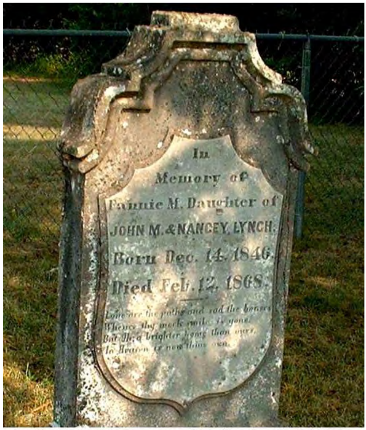
Lynch Cemetery, Redstone Arsenal, Madison Co., AL, July, 2002.

Epitaph: Long are the paths and sad the bowers Whence thy meek smile is gone. But Oh: a brighter home than ours, In Heaven is now thine own.