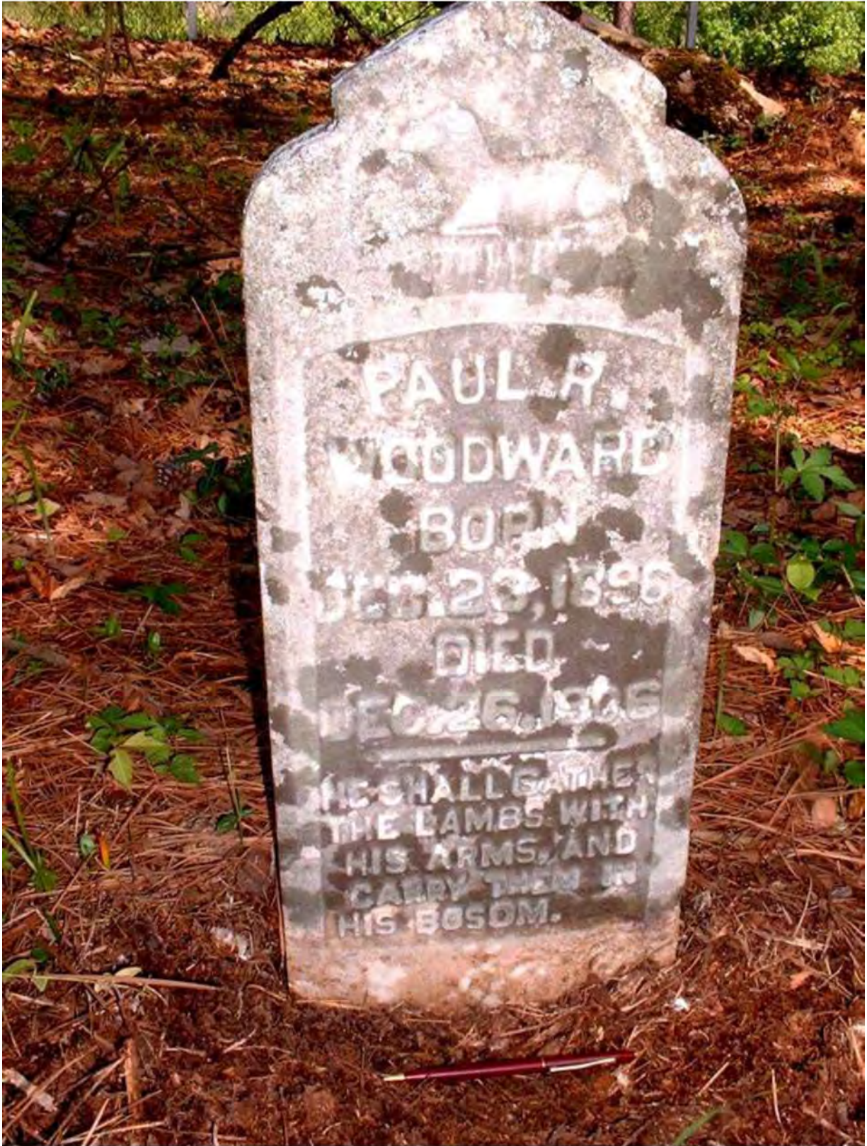
Woodward Cemetery, 88-2, Redstone Arsenal, Madison Co. AL, April 28, 2003