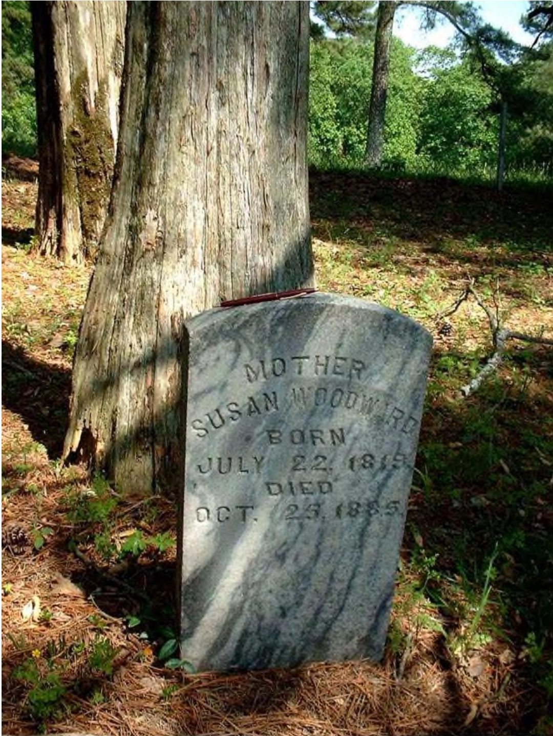
Woodward Cemetery, 88-2, Redstone Arsenal, Madison Co. AL, April 28, 2003