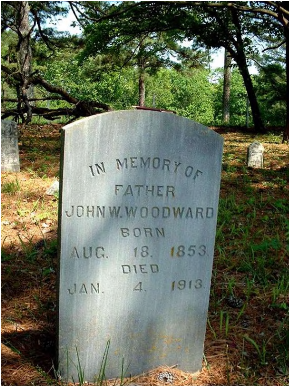
Woodward Cemetery, 88-2, Redstone Arsenal, Madison Co. AL, April 28, 2003