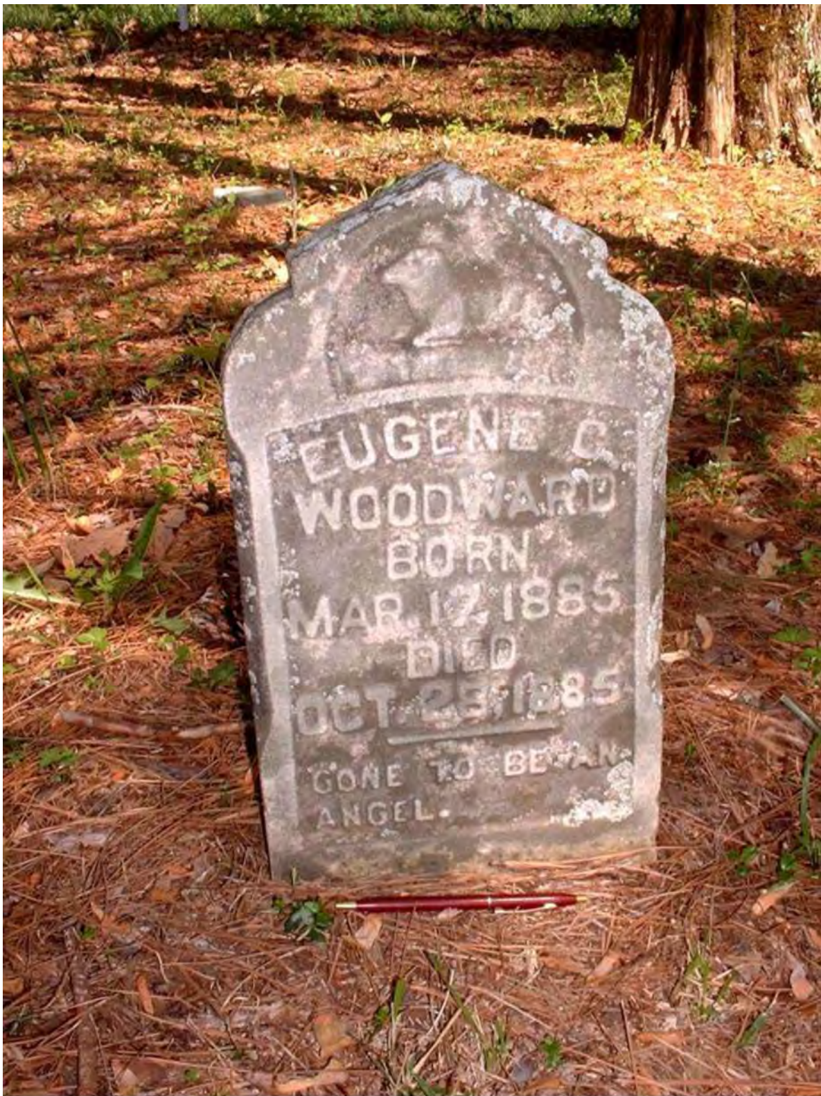
Woodward Cemetery, 88-2, Redstone Arsenal, Madison Co. AL, April 28, 2003