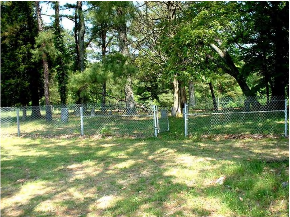
Woodward Cemetery, 88-2, Redstone Arsenal, Madison Co. AL, April 28, 2003

Appropriately near the “end of the road” is the Woodward family cemetery, just a little west and north of the southernmost part of Pershing Road.