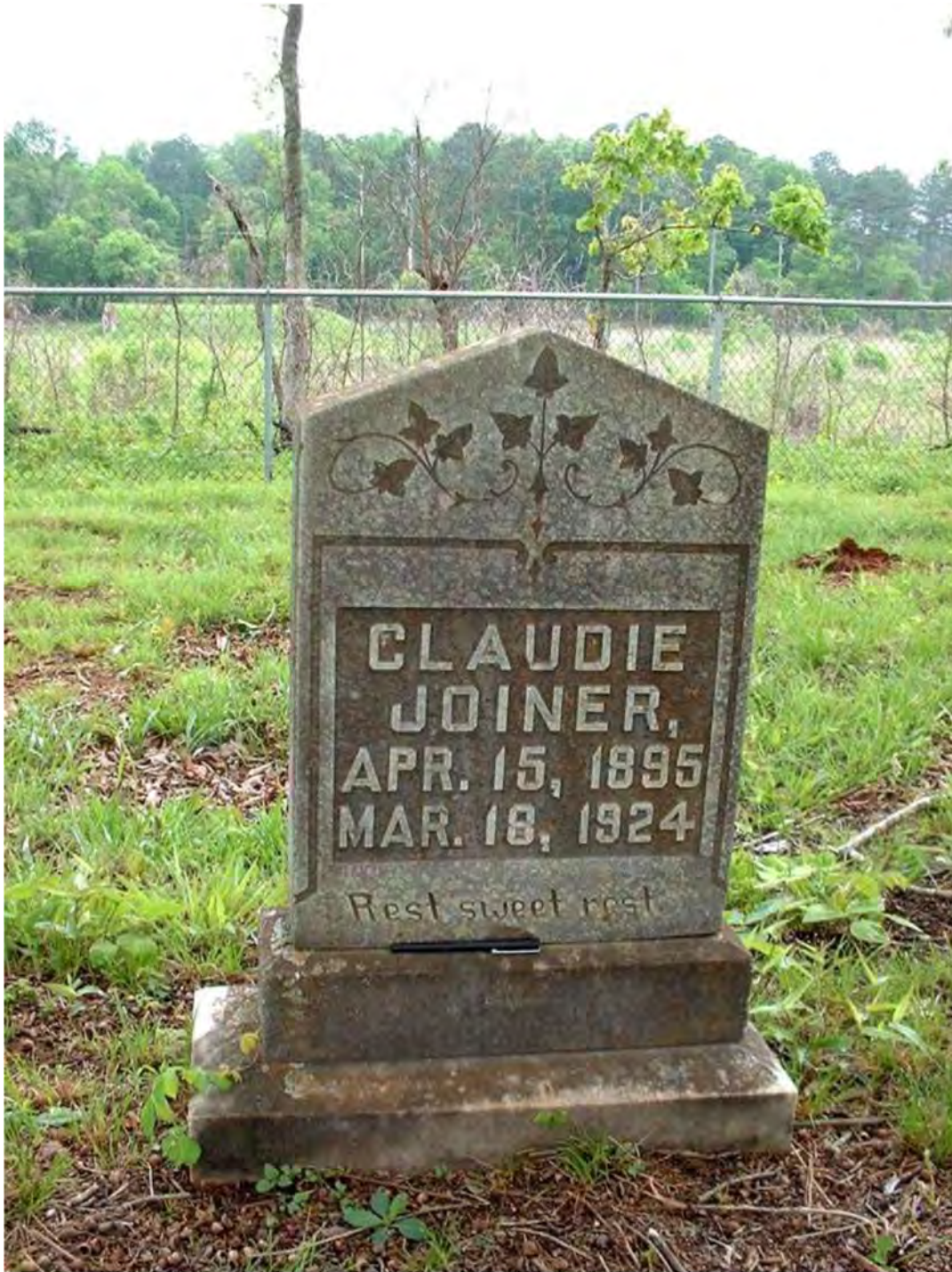
Joiner - Lacey Cemetery 89-2, Redstone Arsenal, Madison Co. AL, April 26, 2003 This large cemetery has about 100 obvious grave depressions, but room for about 300 burials, if full; no other tombstones found.