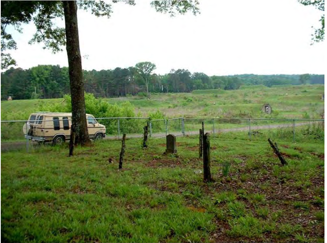
Joiner - Lacey Cemetery 89-2, Redstone Arsenal, Madison Co. AL, April 26, 2003 Located on north side of Honeysuckle Road, between Igloos 8936 and 8937, east of Patton Road View toward entrance gate at SW corner, showing inner fenced area around grave of Claudie Joiner