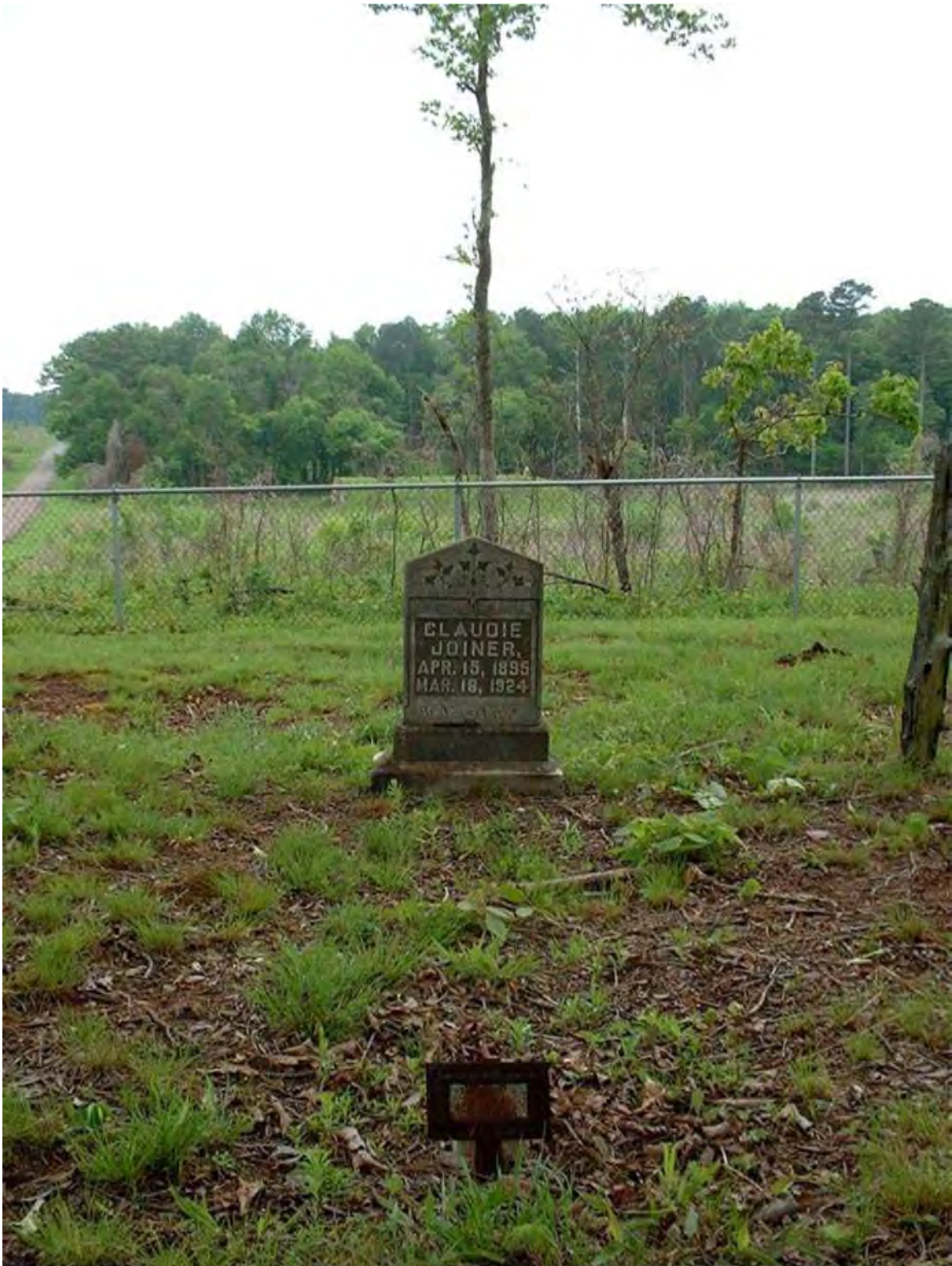
Joiner - Lacey Cemetery 89-2, Redstone Arsenal, Madison Co. AL, April 26, 2003 Honeysuckle Road in background at upper left; Igloo 8936 behind tombstone