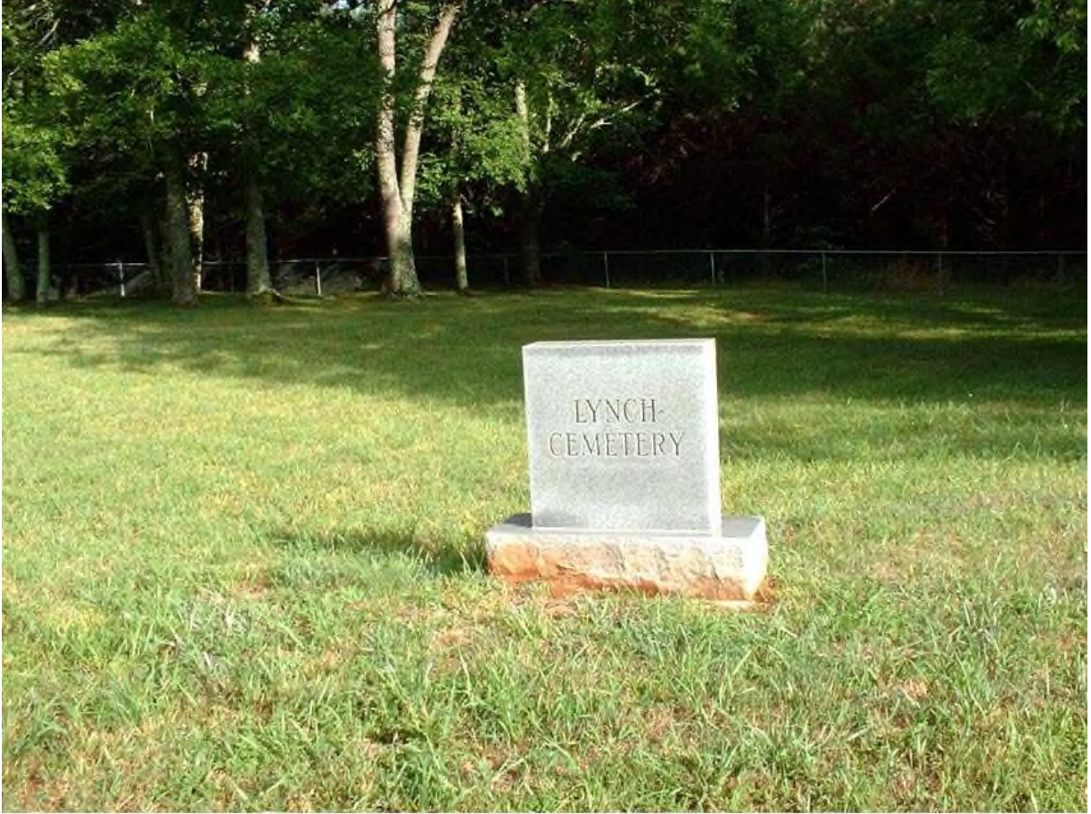
Lynch Cemetery (89-3), Redstone Arsenal, Madison County, Alabama, July 2002.

maps used in this study cannot precisely fit the cemetery into either quarter section with authority.