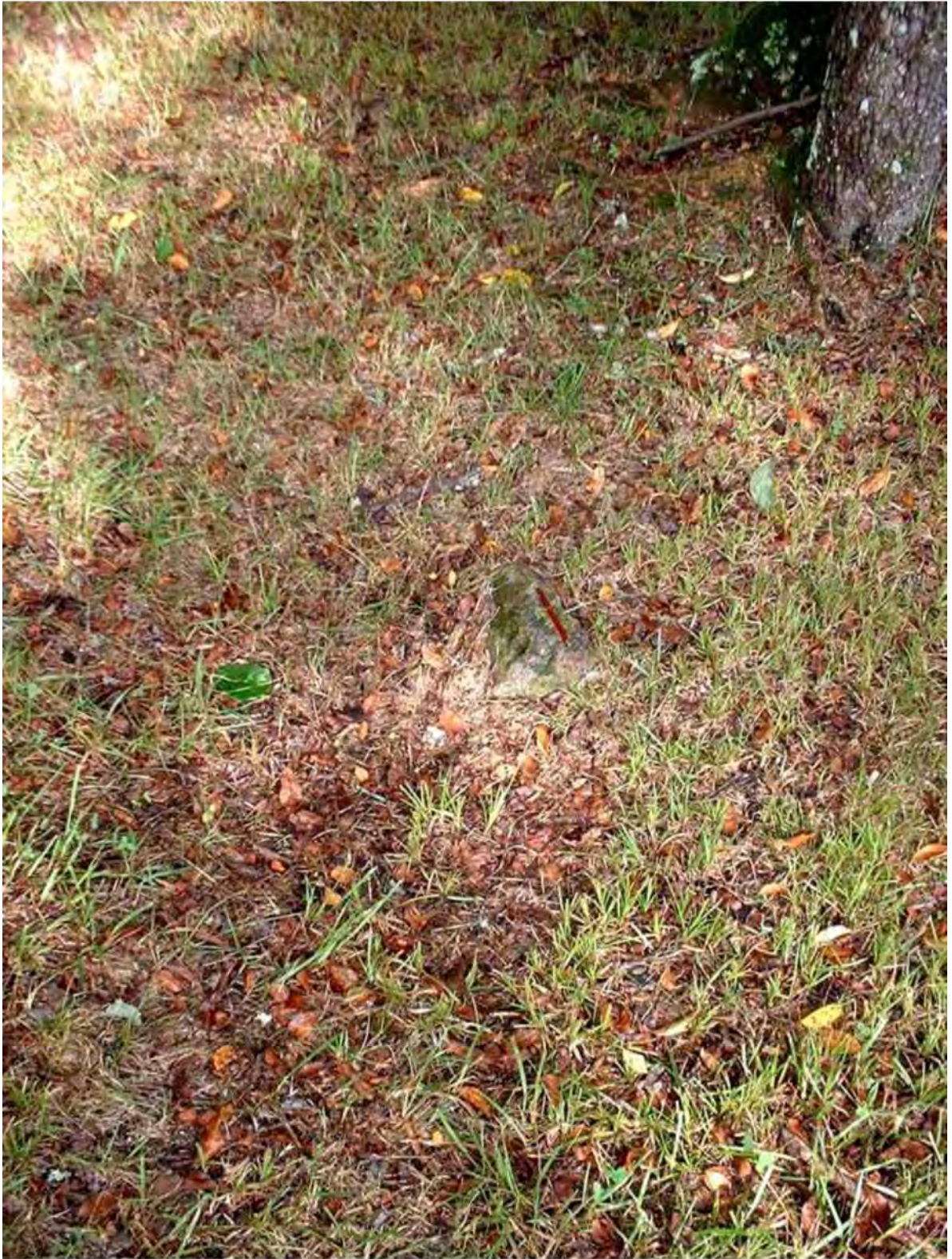
Lynch Cemetery (89-3), Redstone Arsenal, Madison County, Alabama, July 2002.