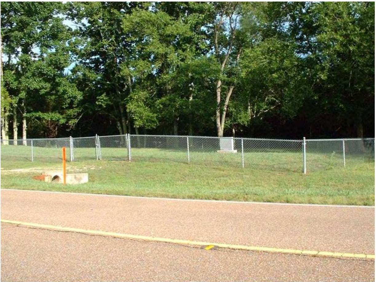
Lynch Cemetery (89-3), Redstone Arsenal, Madison County, Alabama, July 2002.

This cemetery is located on the south side of Buxton Road, east of the Timmons Cemetery Road and Briar Road intersections. It is about on the line between the NW/4 and the NE/4 of Section 22, Township 5, Range 1W. It may be entirely within either the NW/4 or the NE/4, but the accuracy of