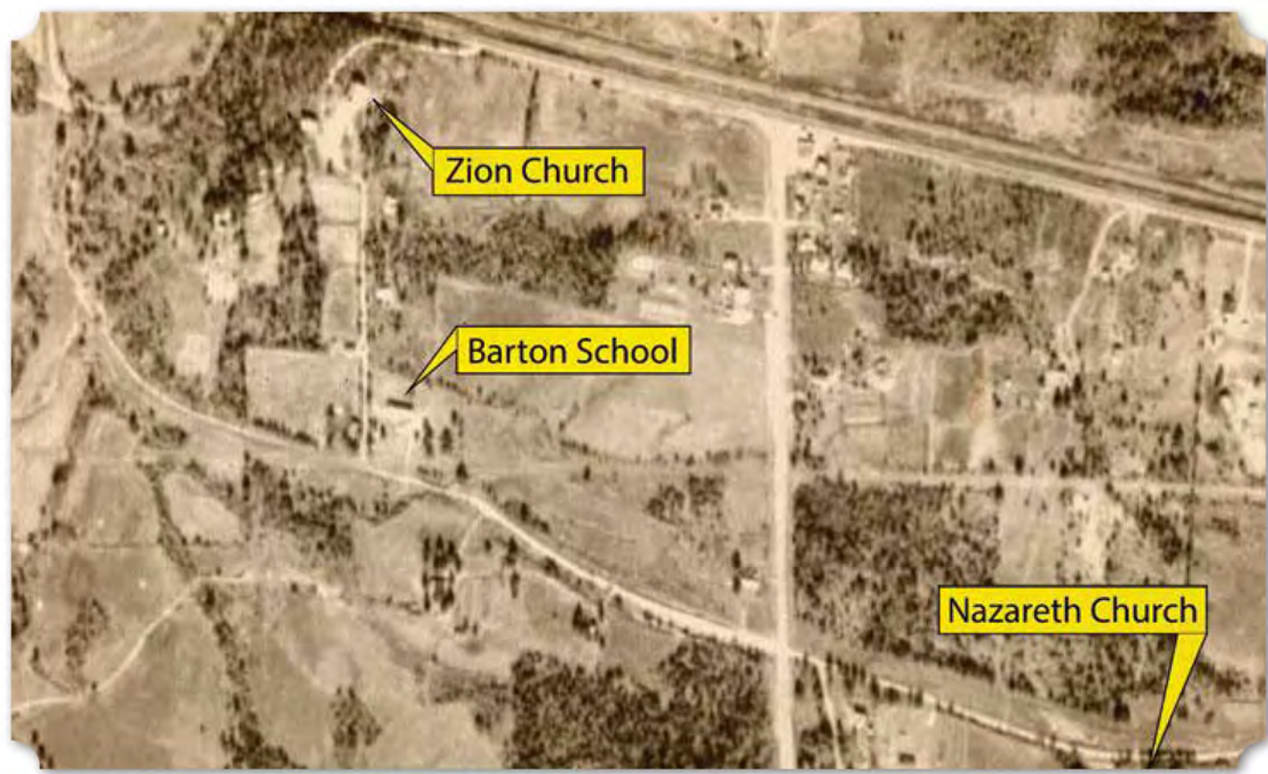
(Above) Aerial Photograph of Barton in 1949 (Below) 1954 USGS/TVA Topographic Map of Barton, Pride, Alabama Quadrangle (Below Right) 1971 USGS/TVA Topographic Map of Barton, Pride, Alabama Quadrangle