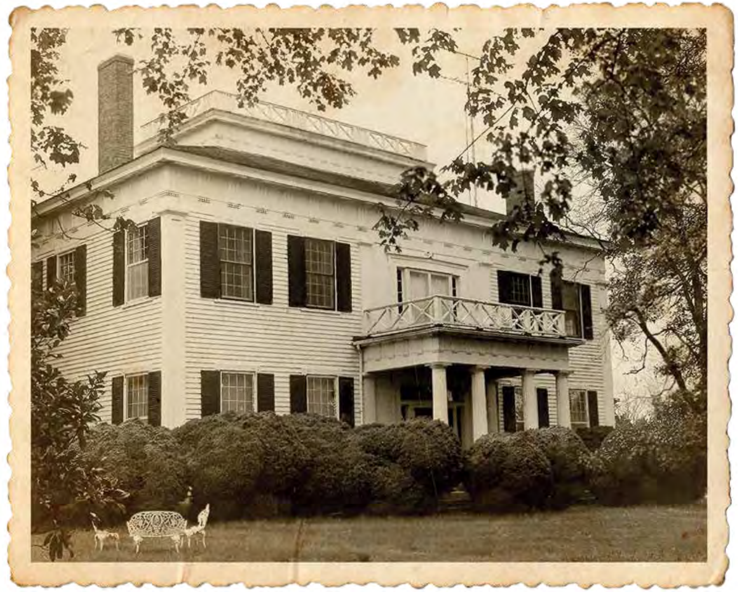
(Below) National Register for Historic Places, Barton Hall, 1973