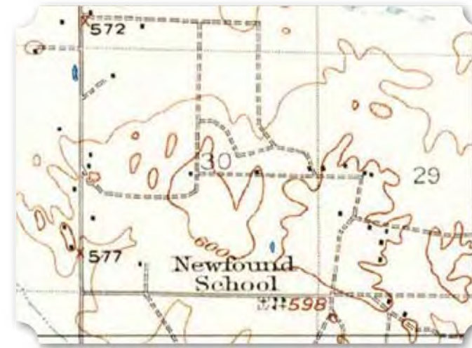
(Right) 1914 and 1924 USGS Topographic Maps of Mt. Pleasant Area, Muscle Shoals and Tuscumbia, Alabama Quadrangles (Far Right) 1936 USGS/TVA Topographic Maps of Mt. Pleasant Area, Killen and Leighton, Alabama Quadrangles

and 1916, Mt. Pleasant School is identified on the opposite side of County Line Road from an unlabeled church. The 1936 USGS/TVA topographic map names this area “Alexander Crossroads” and clearly depicts the Mt. Pleasant Church and adjacent cemetery. However, the Mt. Pleasant School is no longer across the road, but located to the south, on the east side of County Line Road. This move apparently occurred