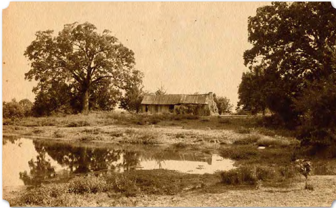
(Left) The Slave House and Pond at Preuit Oaks Plantation, 1986 (National Register of Historic Places Nomination Form) (Bottom Left) The Slave House Turned Tenant House at Preuit Oaks Plantation, 1986 (National Register of Historic Places Nomination Form)