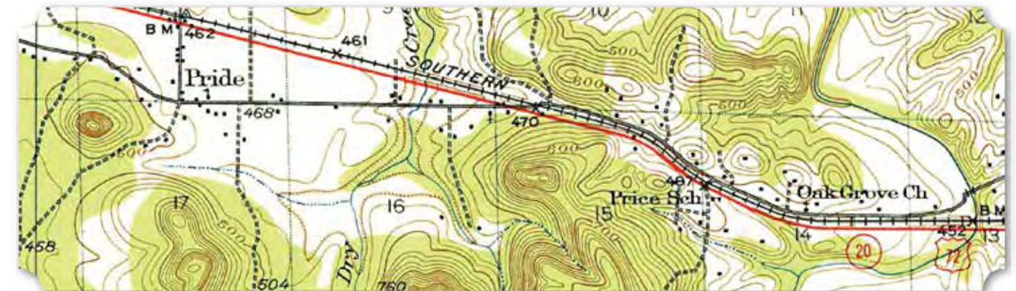
(Below) 1925 USGS Topographic Map of Pride, Barton, Alabama Quadrangle (Bottom) 1936 USGS/TVA Topographic Map of Pride, Pride, Alabama Quadrangle

Pride School was a rural African American schoolhouse located on the east side of Hawk Pride Mountain Road, south of Lee Highway, about 2.5 miles east of the community of Pride. The earliest topographic map of the area is from 1925, which labels the school "Price School." This spelling mistake is corrected the following year. However, the Pride School is not depicted on the 1954 USGS topographic map. According to the historical marker for Cherokee