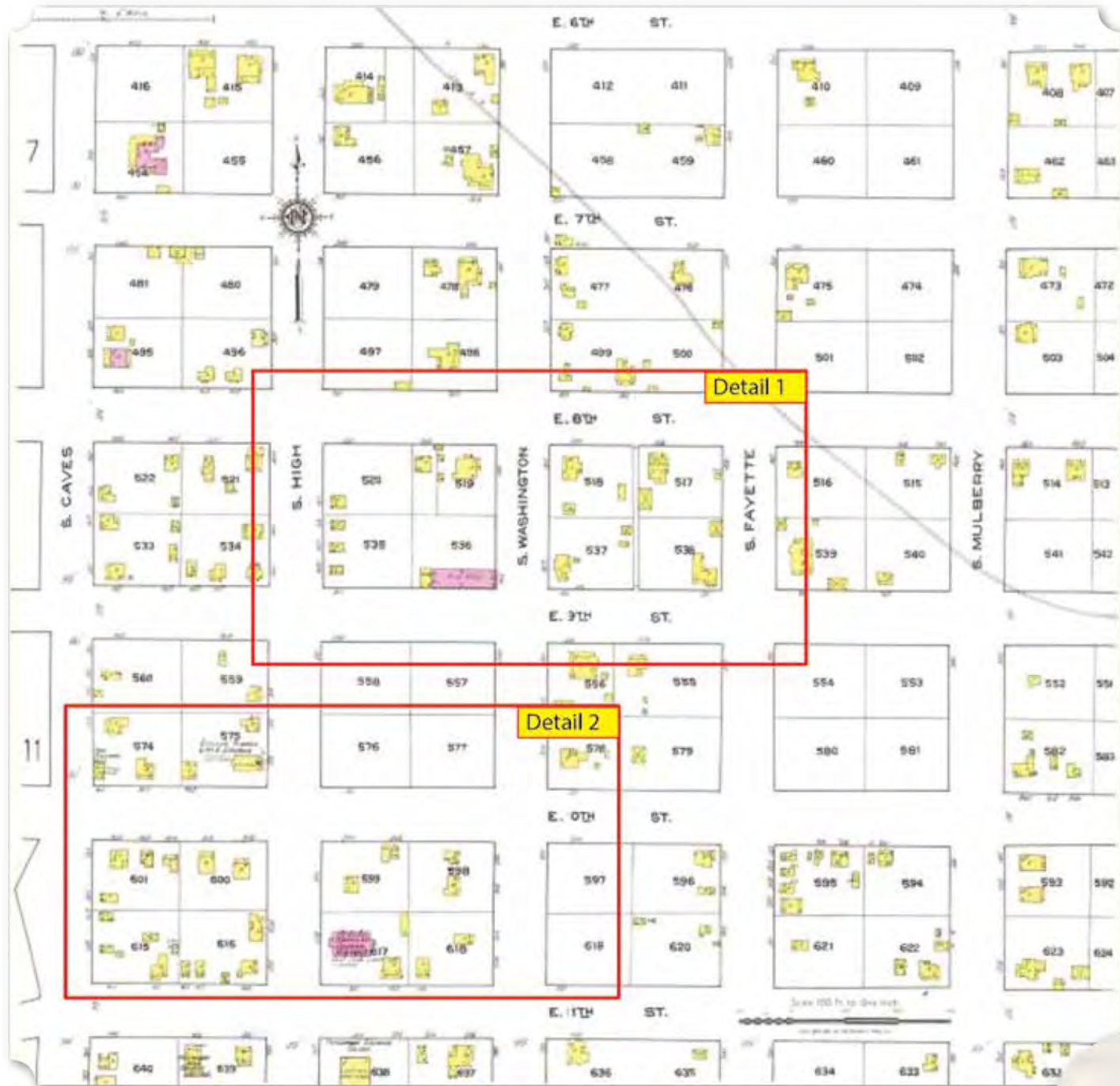
(Below) Excerpt of Sanborn Fire Insurance Map of Tuscumbia, Colbert County, Alabama. Sanborn Map Company, 1921. Showing the Southeast Quarter of Tuscumbia (University of Alabama, Historical Map Collection, Online)