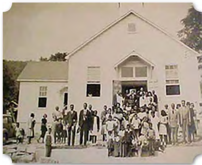
(Top) The Present-Day Scottsboro Boys Museum & Cultural Center (Google Street View, 2014) (Above) The Colored Methodist Episcopal Church of Scottsboro, Circa 1948, when the West Wing was Added (Scottsboro Boys Museum & Cultural Center Website)

Located just south of the neighborhood and railroad tracks on West Willow Street near North Cedar Hill Drive, is the Scottsboro Boys Museum and Cultural Center. Formerly the Joyce Chapel United Methodist Church, the building now houses exhibits and collections on the historic events surrounding the Scottsboro Boys and the Civil Rights Movement of the mid-20th century. According to the website for the museum, the church was originally built in 1878 by former slaves and originally held the Colored Methodist Episcopal Church of Scottsboro. This church was built in 1904, making it the oldest African American church still standing in Jackson County. The African American community lived in shotgun houses to the north of the church and the congregation continued to use the church until 2009 when their numbers dwindled and they found a new owner in the Scottsboro Multicultural Foundation.