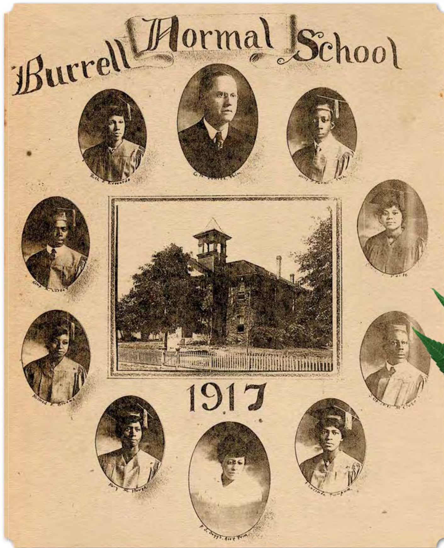
(Left) Burrell Normal School, Class of 1917 (Below) Burrell Slater High School, 1959