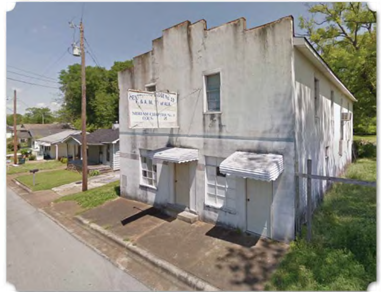
(Above) 1918 Plat Map of Handy Hill Subdivision (Right) Excerpt from 1921 Sanborn Fire Insurance Map of Burrell Normal School (yellow) and Handy's Hill Development (orange) (Far Right) (Top) 1921 Sanborn Fire Insurance Map of Florence, Handy's Hill Neighborhood (Bottom) Masonic Lodge No. 19, in Canaan, Built 1959