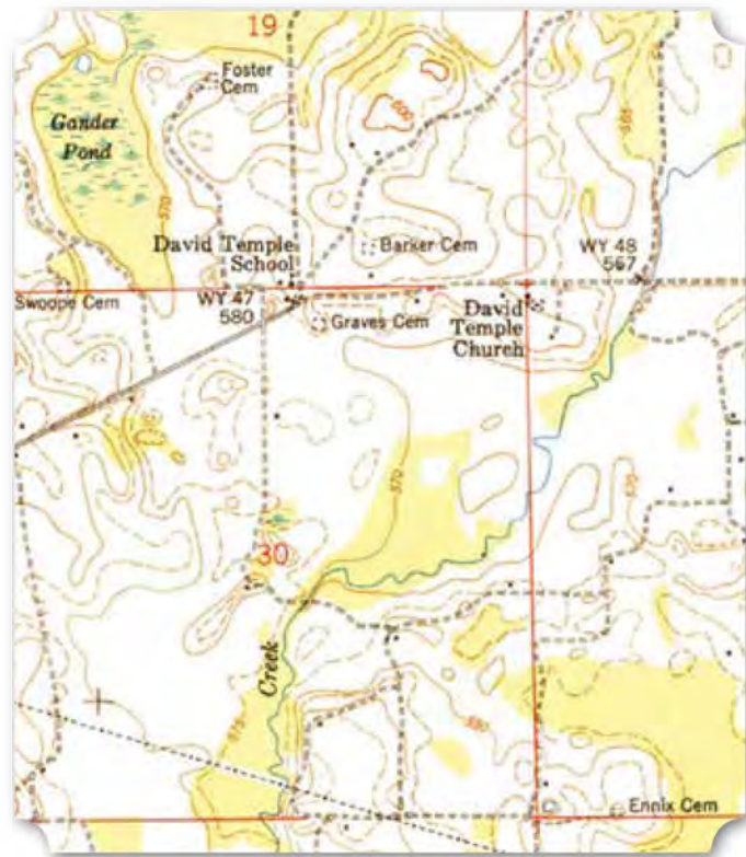
(Above) 1951 USGS/TVA Topographic Map of David Temple School, Hillsboro, Alabama Quadrangle (Below) 1974 USGS/TVA Topographic Map of David Temple Church, Hillsboro, Alabama Quadrangle