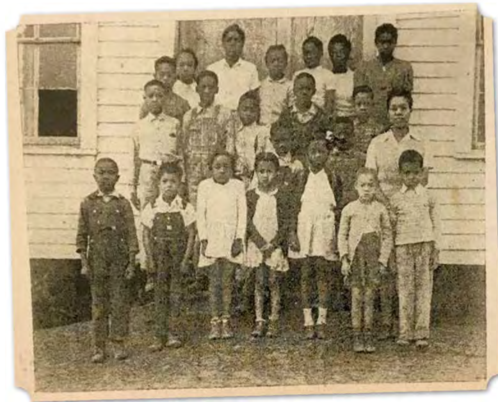
(Above) Image of Class in Front of Beulahland School, Date Unknown (Below) Aerial Photograph of Beulahland School in 1949