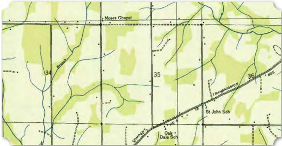
(Left) 1935 USGS Topographic Map Showing Moses Chapel (Below) Historic Photograph of Students and Teachers of the Moses Temple School