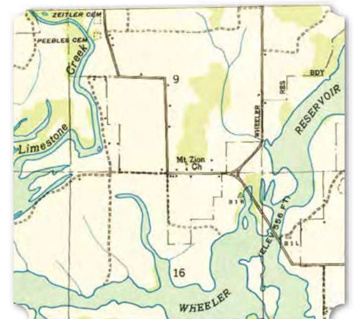
(Below) 1936 USGS Topographic Map Showing Mt. Zion Church

The Pryor-Thatch Cemetery, or simply Thatch Cemetery, lies across the road from the church. The sign at the cemetery indicates that it was established