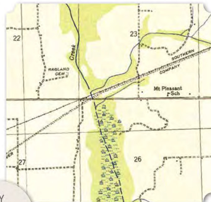
(Below) 1935 USGS Topographic Map Showing Moses Chapel