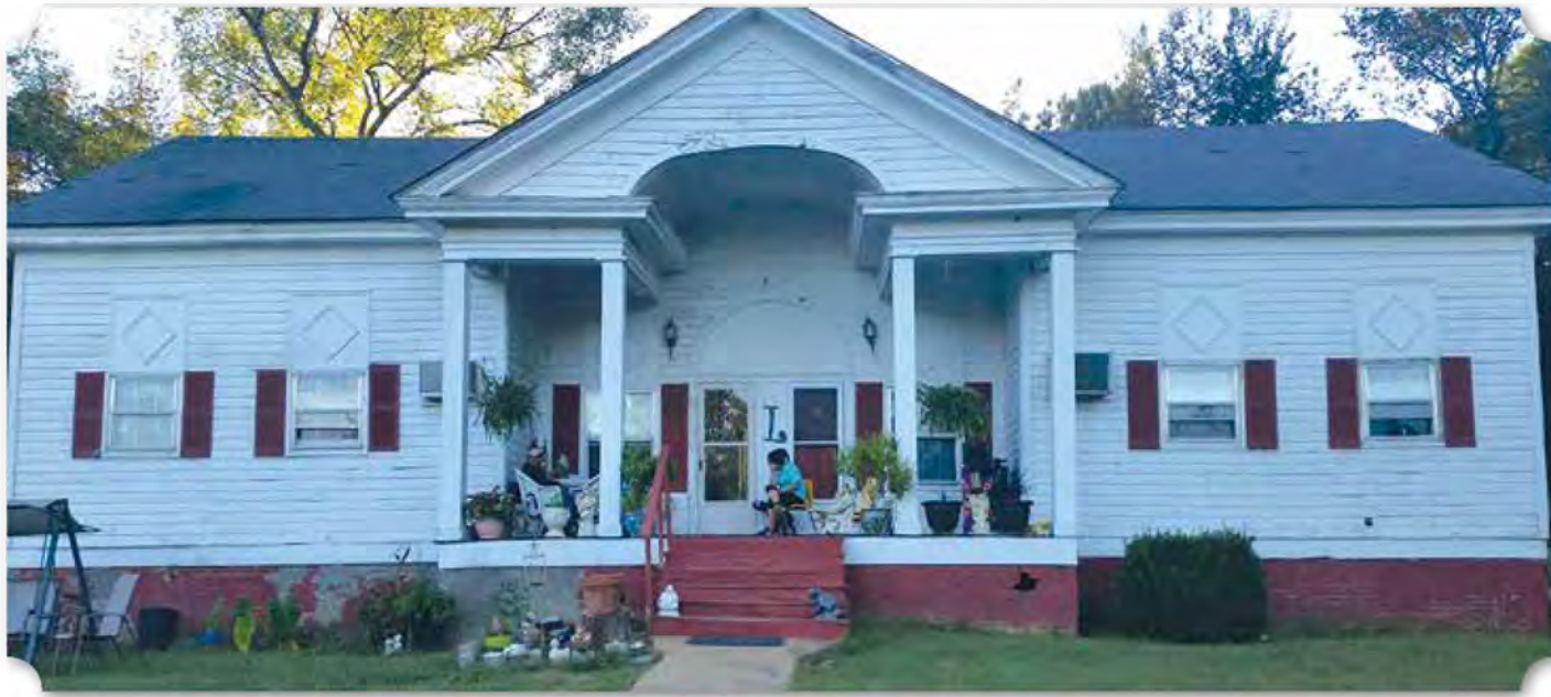
(Above) Photograph of Blue Ridge School, 2017

This building cost a total of $3,425, of which $250 came from the African American community, $2,675 from public funds, and $500 from Rosenwald. Due to the previous fire, the new schoolhouse was insured for $2,380.