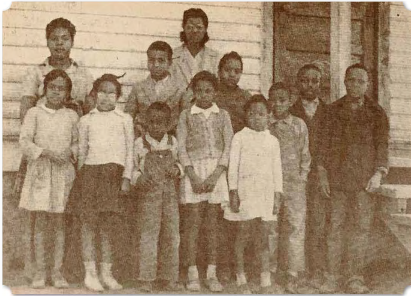
(Above) Image Of Class in Front Of Payne School, Date Unknown (School Days, 2011)