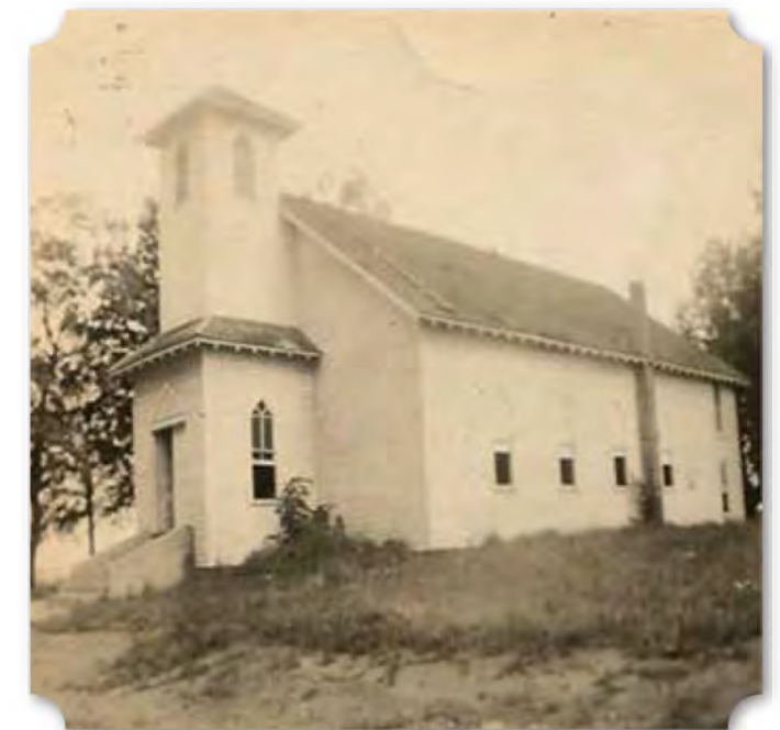
(Above) Photograph of Cedar Grove Church, Date Unknown