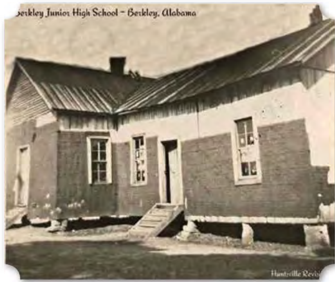
(Above) Berkley School on Madison County Land Records, 1959-1968 (Index of Land Records, Madison County, Alabama) (Left) Photograph of the Berkley School, or Berkley Junior High School, Date Unknown (Bottom Left) Photograph of Parents Gathering at the Berkley School in the 1970s