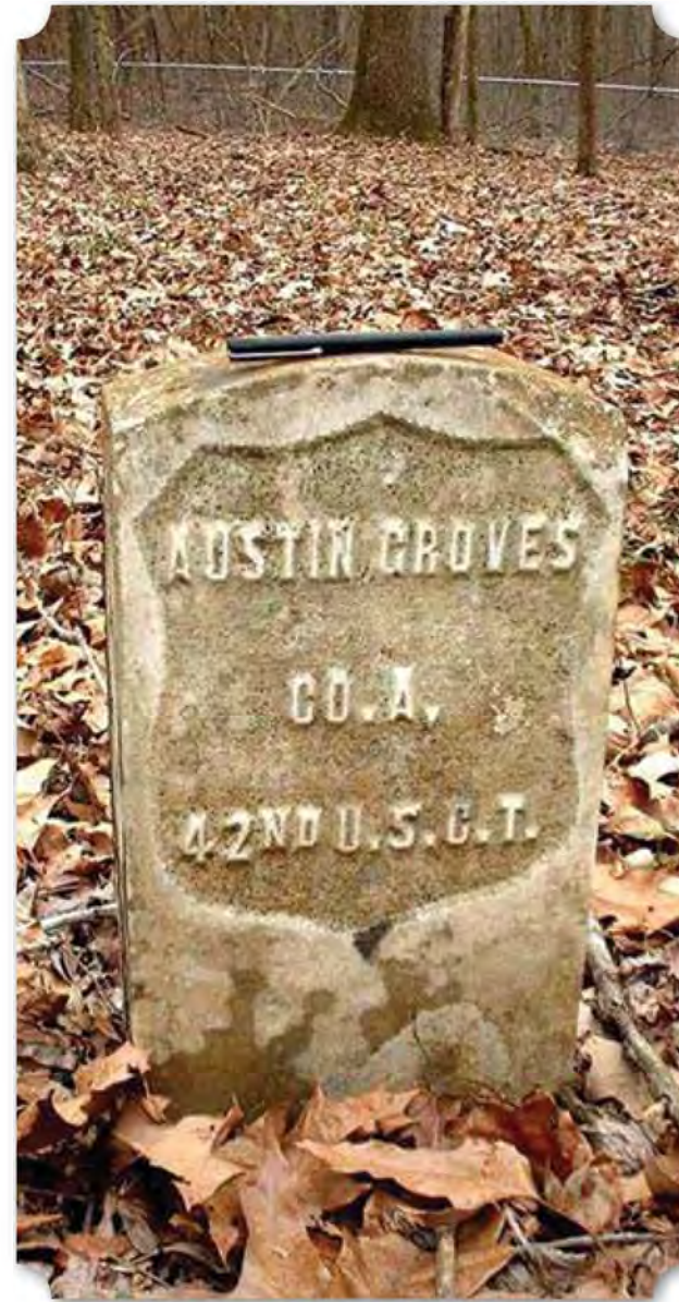
(Above) Photograph of Austin Groves' Headstone

This small cemetery is now located on Redstone Arsenal. While there are several graves here, only two are marked, one with a fieldstone and the other with a headstone. The headstone for Austin Groves has the