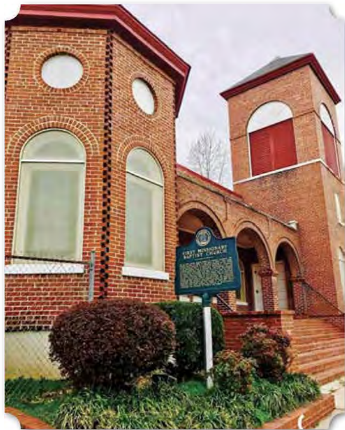
(Below) First Missionary Baptist Church

Together, the community built one of the oldest churches in Decatur. This church was designed by prominent African American architect, Wallace Augustus (W.A.) Rayfield, well known for his work on the 16th Street Baptist Church in Birmingham. Built in 1921 at a cost of $1,250, the church is located at the southern corner of Grove and Vine streets in old Decatur. The church is still in use today.